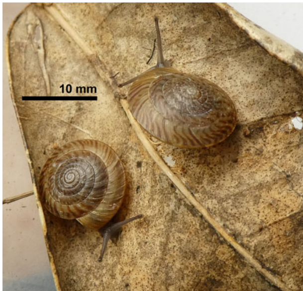
PLATE 1 Two adult-sized greater Bermuda land snails Poecilozonites bermudensis on Port's Island, Bermuda (Fig. 1).

the feature in a random direction. Control sites were a similar distance from the sea and within the same plant community, but without rocks, C. equisetifolia trees or large amounts of C. equisetifolia litter.