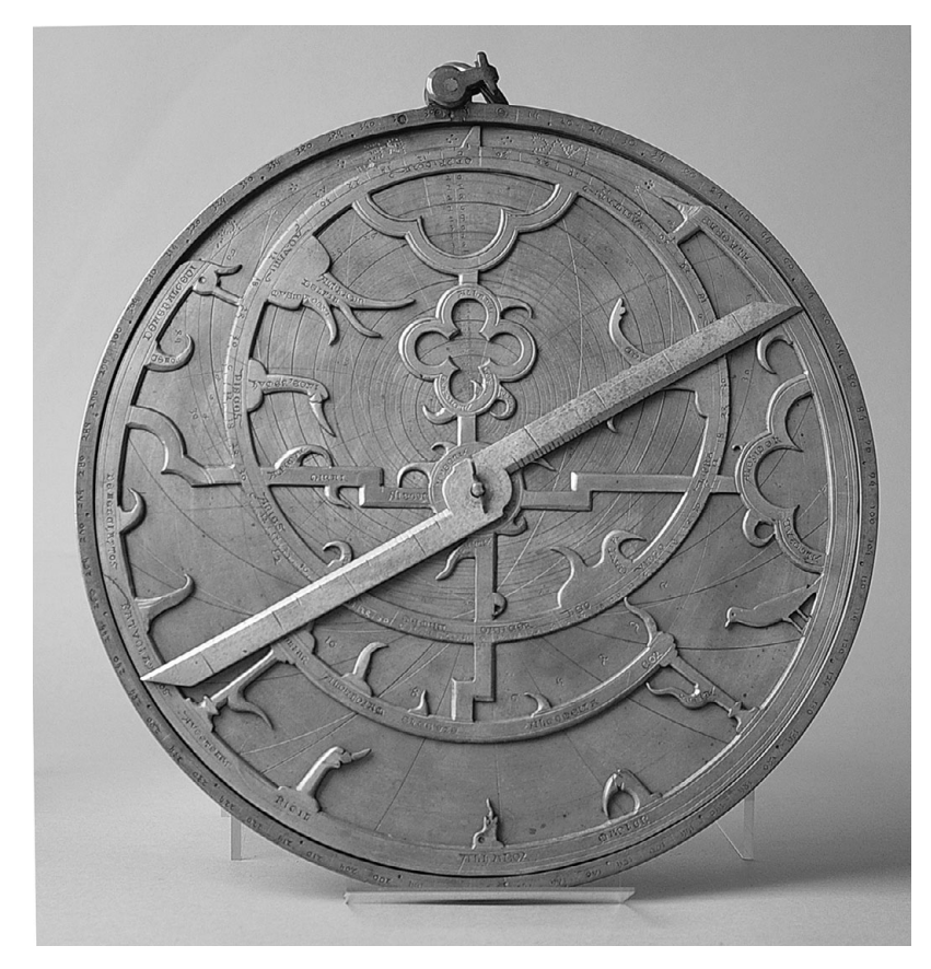
Figure 1.1 Wh.1264, an English astrolabe, c . 1350.

(XRF) analysis, diffraction analysis, and scanning radiography have the potential to revolutionise our understanding of instruments. Hard data about their chemical composition or metallic microstructure can, in combination with more traditional comparative techniques, support theories about their age, geographical origins, and methods of production, as well as testing old broad-brush dating tools such as precession data.<sup>7</sup>