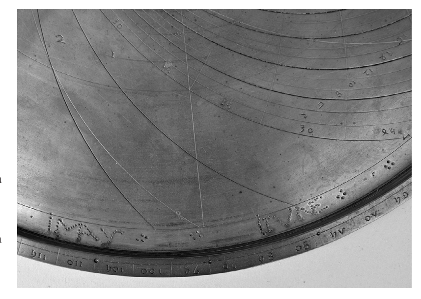
Figure 1.3 Detail from the womb of Wh.1264, showing the equator, almucantars, and unequal hours, and a finer Great House line (with corrected '6'). Note also the hammered-in month names and diamonds.

womb, so it may be questioned whether it ever had separate tympans. In addition, the single stereographic projection has, unusually, neither a named location nor a latitude. These details would have been omissible if there was no need to distinguish between different projections; if, perhaps, its user had no plans to travel with it. On the other hand, if an astrolabe was intended for use at a single latitude, the mater could be reduced to a single plate, as we find on Wh.4552, a near neighbour in the Whipple's current display. The fact that Wh.1264 has a recessed womb surrounded by a rim suggests that it was at least intended to be equipped with tympans. In any case, astrolabes without tympans are rare, whereas it is relatively common for tympans to have been lost from astrolabes now on display in museums. Lacking any other evidence, we must assume that this is the case with this instrument. How the tympans would have been secured in place is not clear, though since the throne is a little loose it is possible that it was originally fitted differently, and that the refitted throne has filled a slot that was previously located just beneath, as is customary. Alternatively, perhaps the astrolabe is incomplete: its maker may have failed to fit the womb with lugs, just as he failed to mark the latitude; or, conceivably, he chose to add a rim for aesthetic reasons.