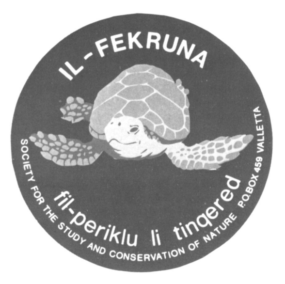
One of the stickers produced for the Maltese 'Save the Turtle Campaign'.

£500 to the Turks and Caicos Islands Project. The fringing reefs in the Turks and Caicos Islands are attracting increasing numbers of tourists, but little attention is being paid to the damage that this might be causing. A team from Hull University is to survey the reefs of South Caicos as part of a three-year plan to establish a system of protected areas for the whole island group. The team will make recommendations for sanctuaries for the iguana Cyclura carinata carinata , magnificent frigate bird Fregata magnificens and resident populations of bottlenose dolphin Tursiops truncatus . Marine habitats, including coral reefs, mangroves and seagrass beds, will also be 264