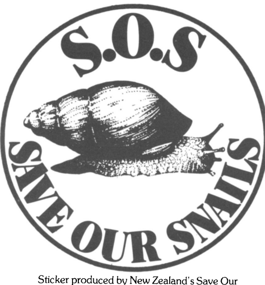
ticker produced by New Zealand's Save O Snails Society.

£500 for the Conservation of Picos de Europa Project, Phase 2. Phase 1 of this project, in which a study was made of the mountains of Picos de Europa in northern Spain, received FFPS support in 1986. Traditional agriculture has allowed wildlife to thrive, but now the area is threatened by roads and tourist hotels, afforestation, the EEC Common Agricultural Policy and rural depopulation. The applicant needs to continue the study, especially of the butterflies, and is attempting to co-ordinate the many individual interests operating in the area to ensure the survival of Picos de Europa's wildlife.