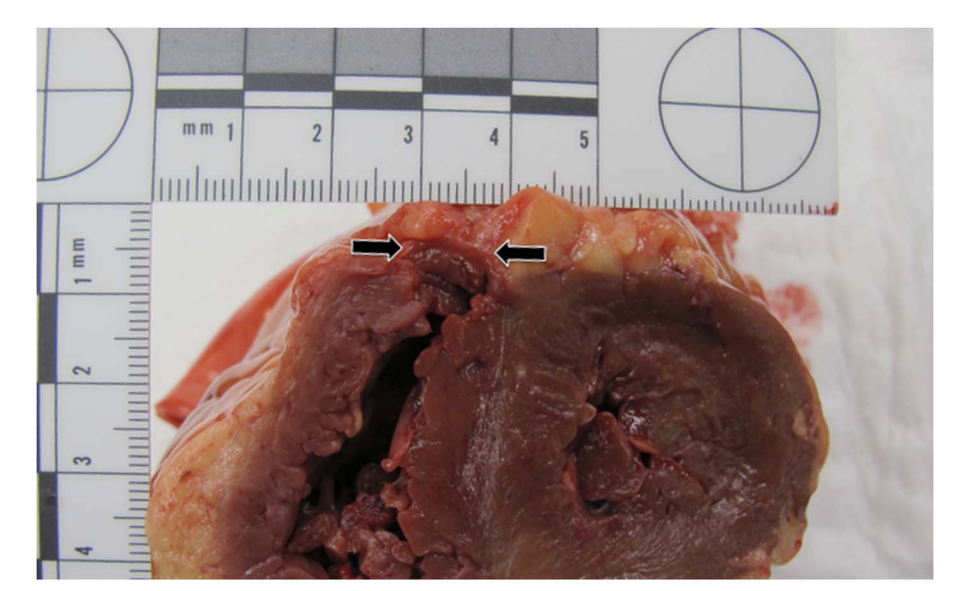
Figure 2. Presence of a transmural myocardial tear of the anterior right ventricle (located between black arrows).

Injuries secondary to the trauma of CPR-associated chest compressions are common. Estimates of the incidence of some type of resuscitation injury ranges from 21%-65%,<sup>1</sup> and up to 97.4%.<sup>2</sup> Although these injuries infrequently have a significant effect on the patient's outcome,<sup>3</sup> clinicians should be mindful that anterior-posterior chest radiographs underestimate true fracture frequency.<sup>2</sup> Hashimoto et al.<sup>1</sup> reported that CPR results in an average of 7.1 broken ribs, with ribs 3-5 being the most frequently involved. Rib injuries occur with greater frequency in women and with increased age.<sup>3</sup> Other CPR-associated injuries that occur with notable frequency (>20% of autopsy cases) include chest abrasion/contusion, defibrillator burns, sternal fractures, upper airway injuries, and pulmonary edema.4