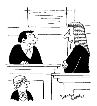
'Two charges of stealing English grammar books? Then I shall give you two simple sentences forming one compound sentence.

I believe that in general most students are literary paupers and lack any sense of discrimination in the use of their mother tongue. Oral exams in colleges are given partly to measure the ability to speak accurately and gracefully. Most students really fail miserably. But a grunt is usually an acceptable negative and an 'aha' is