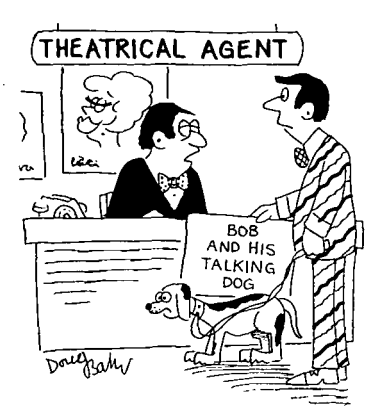
'Sorry. He's got the wrong accent'

When New Zealand English borrows a Maori word sometimes it also borrows elements of Maori grammar, and this would be one of those examples. New Zealand English has incorporated the Maori word piupiu (a garment worn like a skirt) but New