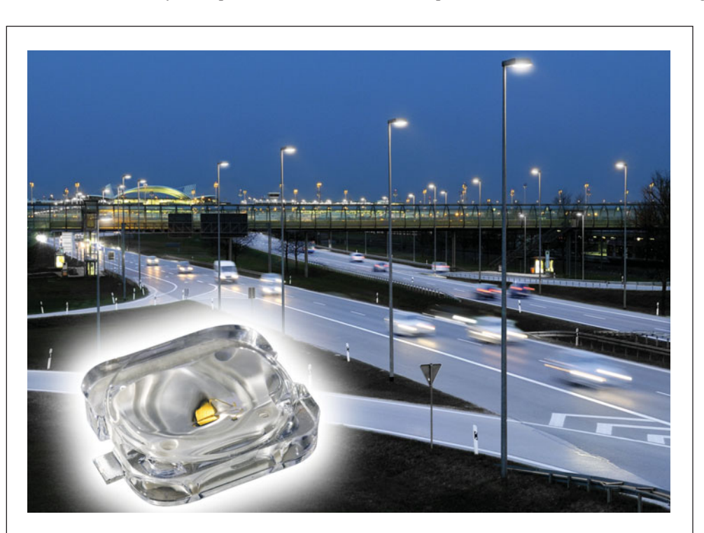
Lighting up roads with LEDs could save energy and cut maintenance costs while considerably reducing light pollution, since light is directed only on the area to be illuminated and not upward.

Even as manufacturers refine LED products to replace traditional light bulbs, engineers are exploring next-generation lighting systems that defy convention. "The idea is to leverage the digital capability of LEDs with advanced sensors and controls to maximize energy savings," said Bob Karlicek, the