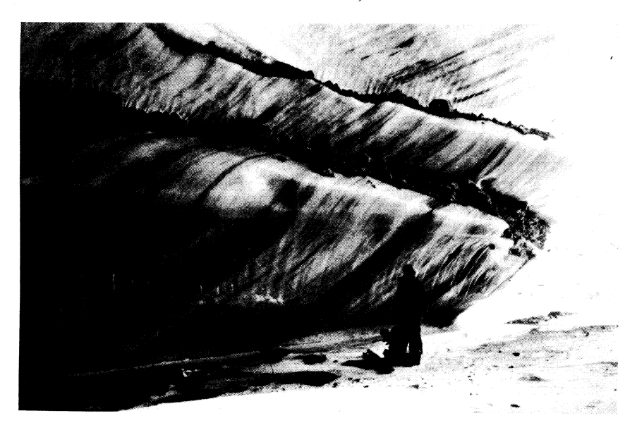
Fig 2B: View from inside one of the tunnel segments leading to 'Leffert Lake'. The stringers of coarse debris along the tunnel wall, representing earlier levels of the englacial river, were found to contain marine shell fragments also. June 9, 1986. GSC-204622.