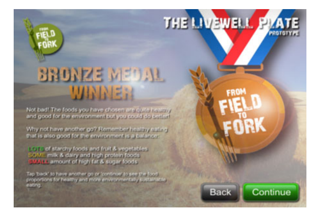
Fig. 2. Example of one of the medal pages.

Cognitive interviewing carried out with eight secondary school pupils and three adults showed that participants could use the app and that they understood the basic principle of balancing health and environment. Generally they had a good knowledge about food groups associated with healthy eating but knew less about the foods that have a high environmental impact, or the meaning of 'good for the environment'. This aspect will be developed further so that the app could be used as an educational tool to learn about healthy and sustainable diets.