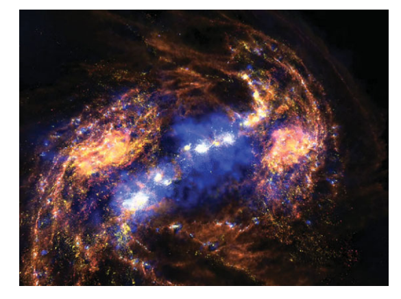
Figure 2. Distributions of star clusters formed during the first encounter at t \sim 460 Myr. Blown and blue means cold and hot gas phases, whereas white points are young stars. The visualization was done by Takaaki Takeda.

and \nabla \cdot v < 0 , where \rho, T and v indicate density, temperature and velocity, respectively). The feedback from type II supernovae (SNe) was also taken into account. These models are the same as those in Saitoh et al. (2008; 2009).