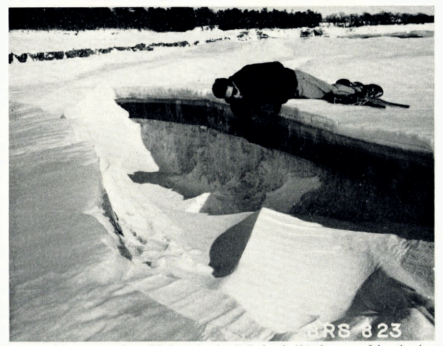
Fig. 3. An exposure of the upper part of one of the humps by a longitudinal crack. Note the 25 cm. of clear river ice underlain by porous ice 5