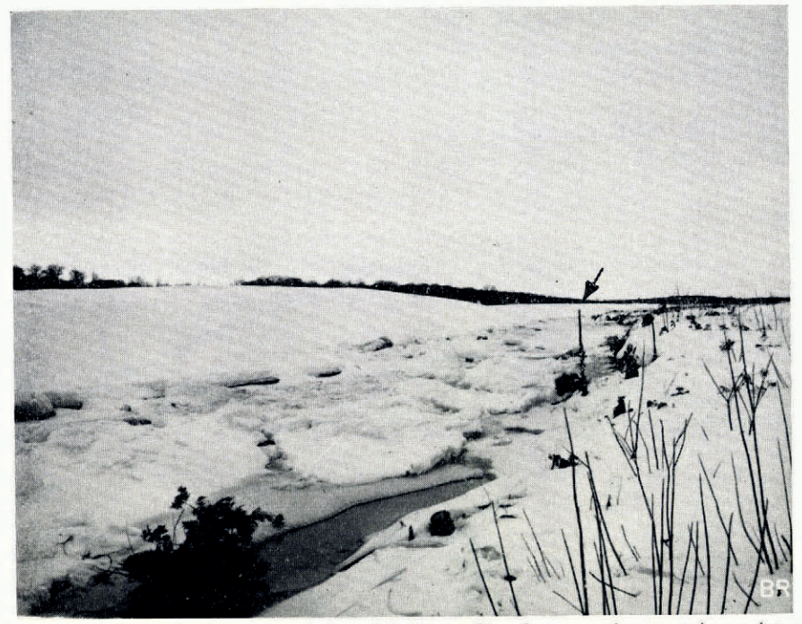
Fig. 2. The ice humps photographed from the north shore of the Ottawa River. Ice pans and water can be seen between the rock face at the shore and the edge of the ice humps. The arrow locates the up-stream hump