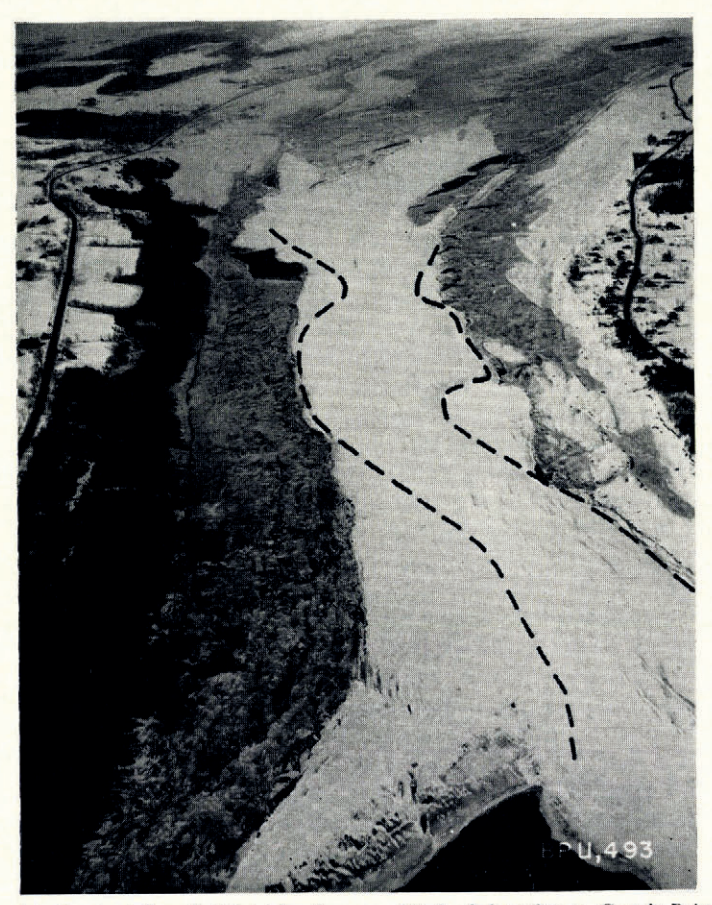
Fig. 1. Aerial view of ice humps at Greece's Point taken from an altitude of about 600 m. Greece's Point and the highway are seen on the right. The dashed lines outline the humped region

Since the ice humps float, the amount of ice beneath the surface must be about nine times that above. This indicates that the maximum depth of the water must be at least 90 m. Hydrographic maps of the river showed only that the depth was greater than 18 m. This was the maximum depth recorded by parties surveying the river for hydrological and navigational purposes.