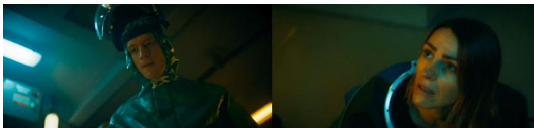
Figure 3. The spy is unmasked.

responsible stewards of international security, while other states are cast as fundamentally irresponsible and denied the same autonomy. 60 Decisions made by the United States and its allies are assumed rational by default, while decisions made by non-Western states are continuously labelled as ideological rather than strategic – delegitimised through reference to religion or culture. 61 Nuclear weapons possess the material capabilities no matter their state ownership, yet time and time again nuclear discourse constructs Western weapons as rational, modern, and safe while non-Western weapons are constructed as impulsive, backwards, and dangerous. Nuclear weapons can be understood as safe and secure in ‘our’ hands, while being dangerous threats in the hands of another. Continuing this narrative into spaces of the everyday, in the BBC’s Vigil , whether nuclear weapons are presented as agents of peace or destruction is conditional to their ownership – to whether they are controlled by ‘us’ or ‘Other’.