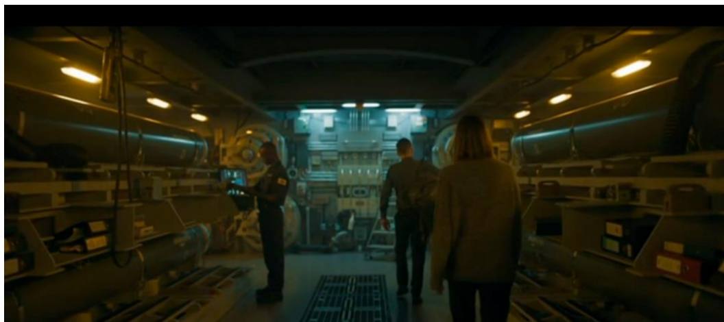
Figure 4. 'Welcome to the bomb shop'.

a much bigger & more powerful one than [Kim Jong Un's], and my Button works! 75 Carol Cohn frankly described the exchange as 'penis-measuring' 76 and Anoosh Chakelian situated the tweet amid a 'long history of nuclear dick-waving'. 77 This language does not highlight destructive power: men, women, and children are substituted with 'collateral damage', the weapons are imagined as newborns 'fathered' by man, and phallic imagery and sexual metaphors make nuclear weapons referents of masculinity. 78 Such gendered sexual metaphors create excitement and support for nuclear weapons. 79