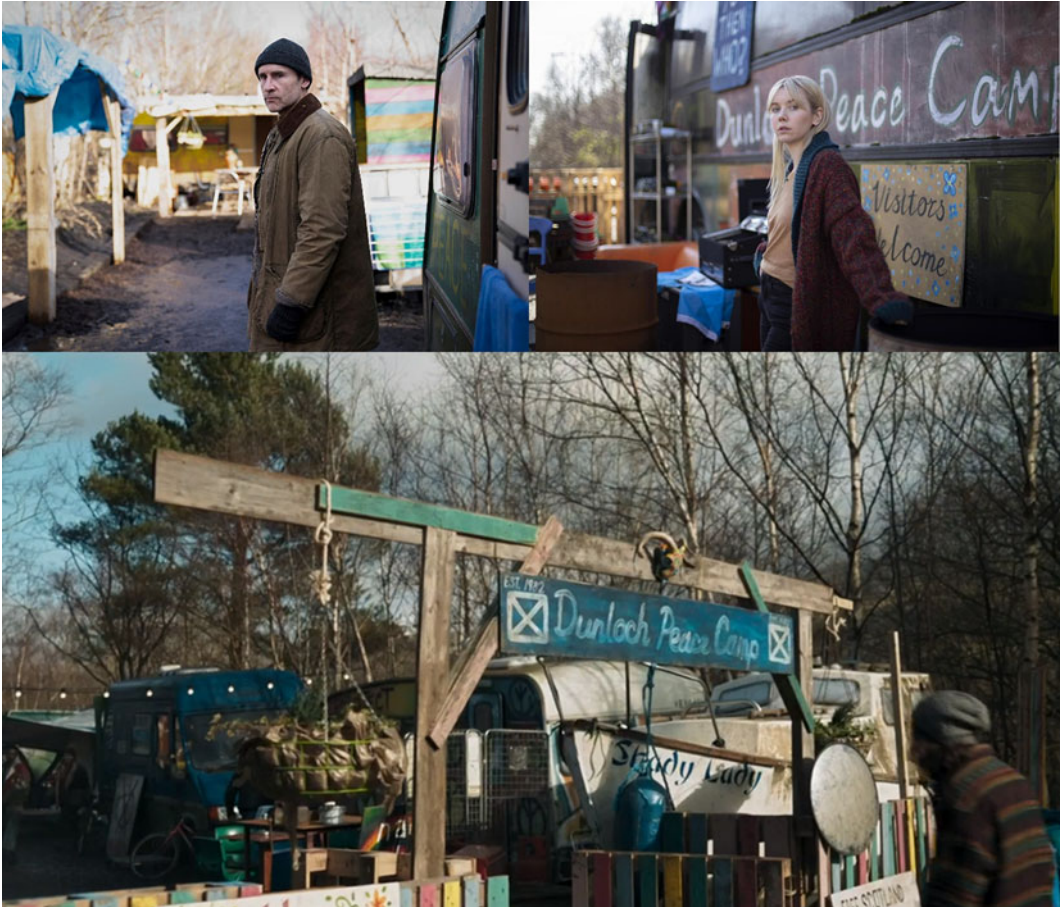
Figure 2. Dunloch peace cam.

aggression is caused by the possession of nuclear weapons) nor falsifiable (since we also cannot know that it is not). Rather, Chilton understands deterrence as a 'socio-cultural product' capable of performing powerful political work. 48 For instance, to 'deter' an enemy does not bestow that enemy with any rationality or agency: one cannot 'dissuade' a shark, but one may 'deter' it. Adversaries are thus not endowed any traits that would merit diplomacy or cooperation. Following, describing nuclear weapons as 'the deterrent' is often reserved for 'our' weaponry. In Western discourses, the United States 'deter' while Russia 'threatens'.