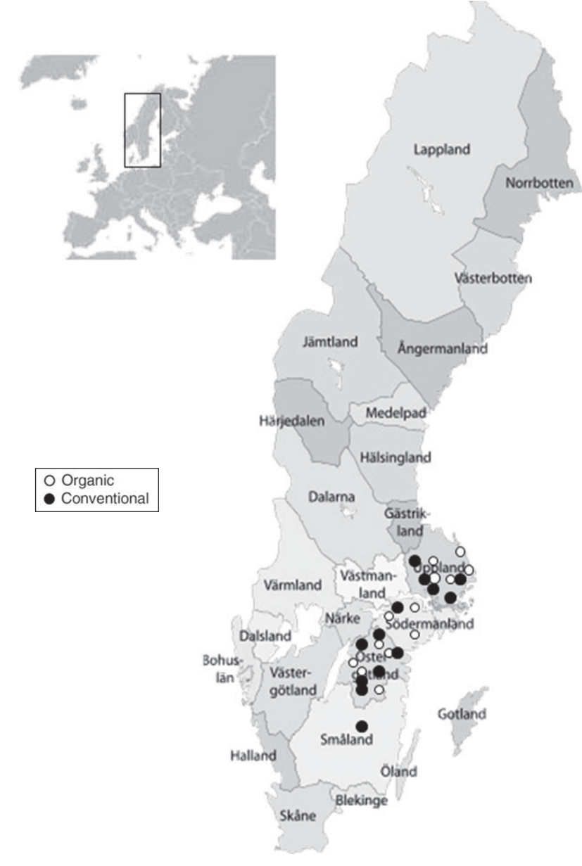
Fig. 1. Map of Sweden showing the location of the organic and conventional herds included in the study.

Rectal faecal samples were collected in individual plastic pots using disposable latex gloves. Samples were cooled within an hour from sampling and kept at 4–8 °C until processed within a week from collection. Data recorded for individual animals at sampling was faecal consistency (all), age and pen type (calves) and lactation stage (cows). Body condition and cleanliness of animal was assessed as overall percent of clean animals and animals in optimum body condition for the whole herd. Standardized five grade assessment scales were used [18, 19]. Animals were considered to be in optimum body condition at grades 3-3.5, and to be clean at grades 1-2. For cows, the SOMRS