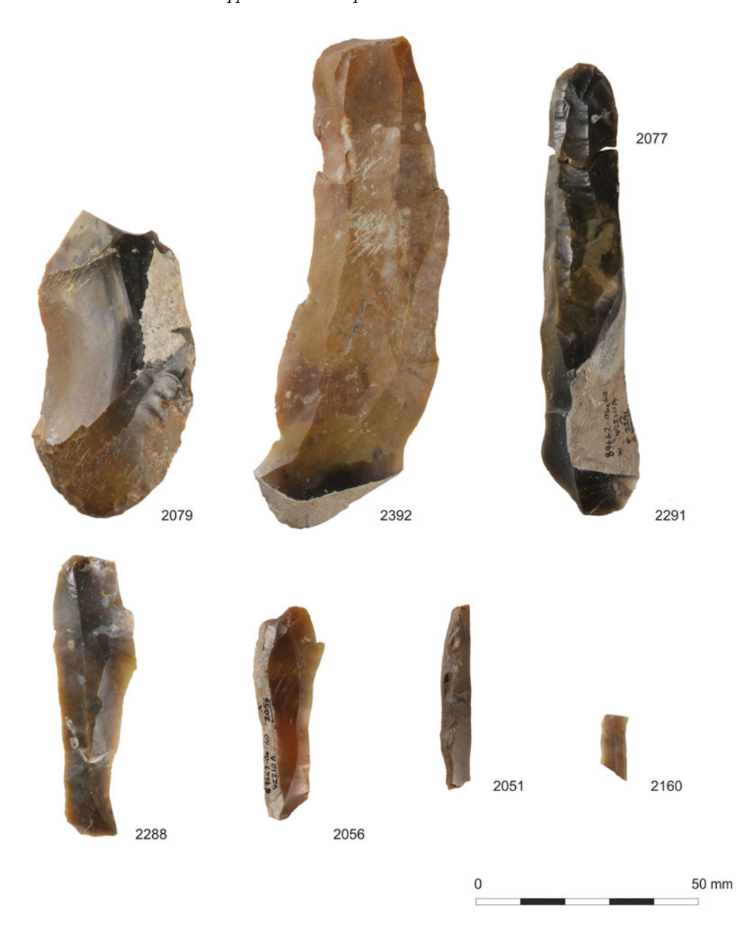
Figure 4. Selection of flint artefacts from the site: end-scraper 20179; blades including refits 2077 and 2291; snapped trapezoidal microlith 2160.