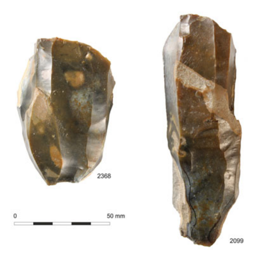
Figure 3. Opposed platform blade cores.

In terms of dating the assemblage, AMS radiocarbon assays have revealed that although many of the bones have poor collagen preservation, a single date on a horse tooth has yielded an age of (SUERC-57714) 9920±39 BP (11410-11 230 cal BP at 95% confidence). The dating is consistent with another date on a partial aurochs skeleton (SUERC-62321) 9946±53 BP (11620-11230 cal BP at 95% confidence) from adjacent channel deposits, and a third date of (UBA-34734) 9977±55 BP (11720-11240 cal BP at 95% confidence) (OxCal v4.2.4; Bronk Ramsey & Lee 2013) on waterlogged Carex sp. seeds from the base of the peat within the channel. All three dates fit with a final Later Upper Palaeolithic age for activity.