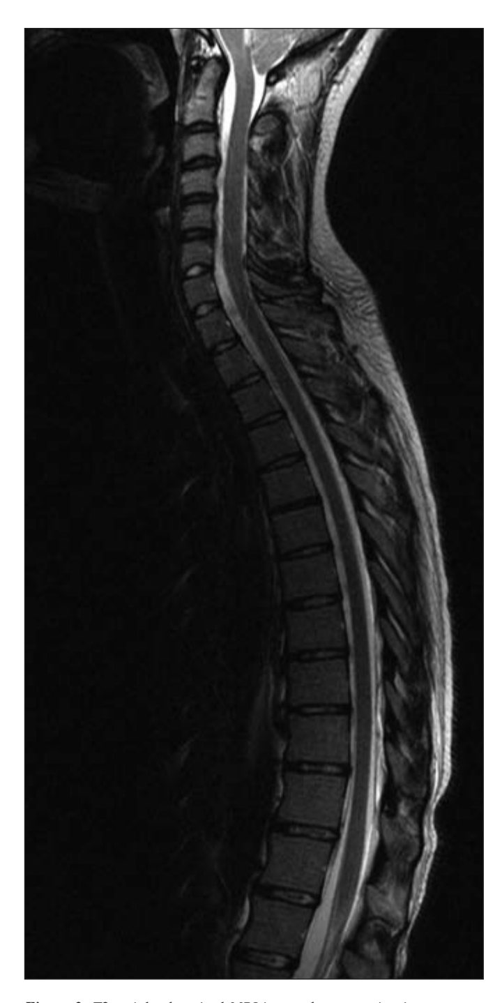
Figure 3: T2-weighted sagittal MRI image demonstrating improvement in the cerebellar tonsillar herniation and resolution of the intramedullary hyperintense signal.

Syringomyelia has been previously reported in patients with intracranial hypotension due to lumboperitoneal shunts<sup>4</sup> and due to a post-traumatic fistula between the C8 nerve root and the pleura<sup>5</sup>. Resolution of the cord signal abnormality was achieved in two cases when the lumboperitoneal shunt was changed to a ventriculoperitoneal shunt<sup>4</sup> and after surgical treatment of the nerve root fistula in one case<sup>5</sup>. Only one other case of SIH causing cerebellar tonsillar herniation and syringomyelia has been described<sup>6</sup>. The patient's symptoms, including focal neurological deficits, continued despite two months of conservative treatment. Due to evidence of an epidural fluid collection from the foramen magnum to the C-2 level she was