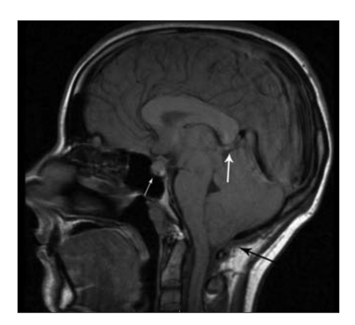
Figure 1: T1-weighted sagittal MRI image demonstrating findings consistent with intracranial hypotension. There is tonsillar descent (black arrow), descent of the hypothalamus and midbrain structures, flattening of the pons against the clivus, enlargement of the pituitary gland (small arrow), and increased acuity of the angle between the vein of Galen and the internal cerebral veins (large white arrow).

Awareness of the imaging signs of SIH is essential to the diagnosis as tonsillar herniation alone could be misinterpreted as a Chiari malformation. Classic imaging findings include descent of the cerebellar tonsils, enhancement of the pachymeninges, flattening of the pons, pituitary hyperemia, subdural hygromas or