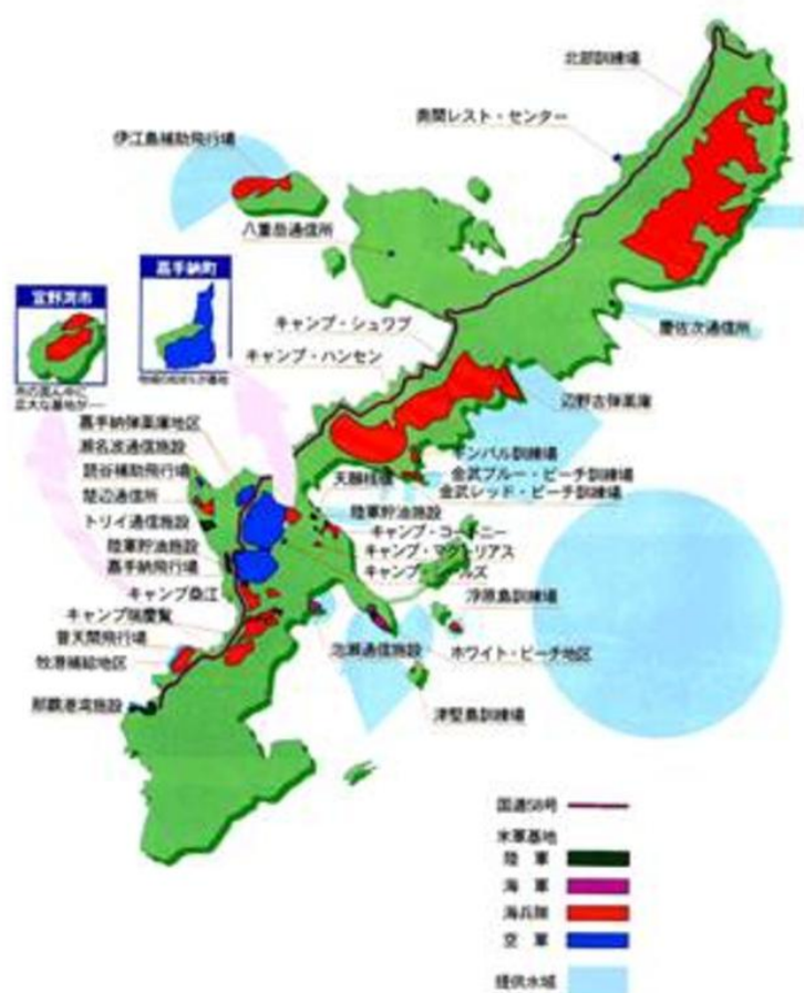
US. military bases and installations on Okinawa. Areas in colors other than green are the sites of U.S. installations on land (red, orange, bright blue) and water (pale blue).

JASDF. Executive Response No. 6 states that it is inappropriate as well as impossible to specify their area. But the map prepared by the Ministry of Foreign Affairs (see below) shows approximate sizes of the areas designated as USAF training airspaces.