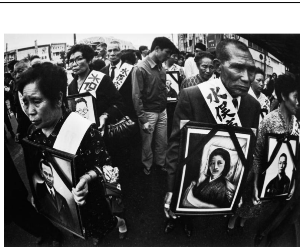
W. Eugene Smith, Minamata Bay, 1971.

Around 1968, people in Japan began to pay attention to environmental concerns and minority issues, as well as to the women's liberation movement. The connections among these developments and the student uprisings warrant deeper investigation.