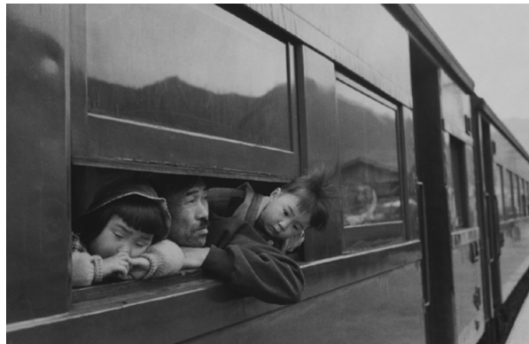
Tōmatsu Shōmei, Santōsha, Iwate Rikuchū Kawai Eki (Third class car), 1959.

The urban migration overwhelmingly consisted of youth. By 1965, 42 percent of Japan's urban population-and 47 percent of Tokyo's-was between 15 and 34 years of age. ix Moreover, since most of the migrants were male laborers, males exceeded females in urban centers such as Tokyo and Osaka by a wide margin.