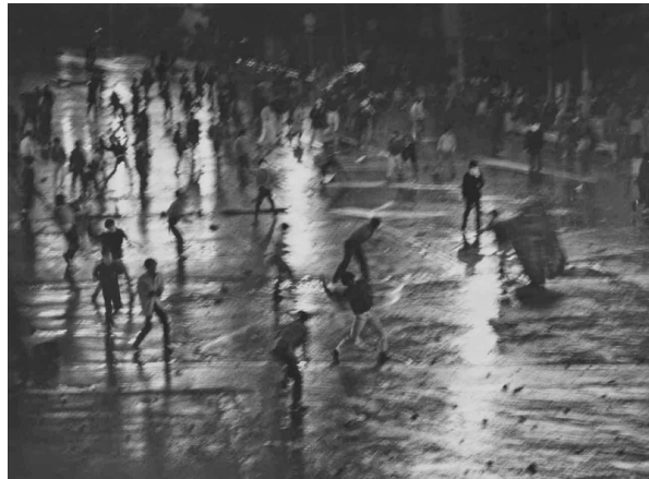
Tōmatsu Shōmei, Young Power 3 from Tōkyō , Shinjuku, 1969.