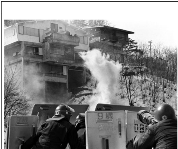
Asama Sansō incident, February 19-28, 1972.

forces with other armed sects to form the United Red Army ( rengō sekigun ). In February 1972, 12 members were murdered in a bloody purge of the group's ranks at a secret mountain hideout. After a dramatic armed standoff with police, broadcast live on national television, the surviving members surrendered. The grisly incident was a tremendous shock to the few remaining student activists, and thereafter the student movement fell into total stagnation.