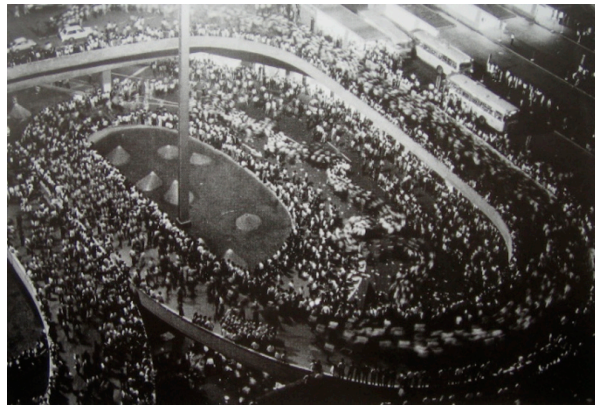
Shinjuku Underground Plaza, July, 1969.

to protest the entry of a US nuclear submarine into the port at Yokosuka, only a few hundred students showed up.