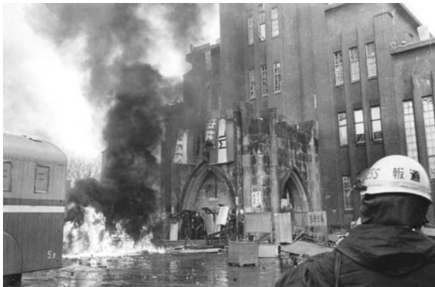
University of Tokyo, suppression of student occupation, January 18-19, 1969.

The precise number of students who participated in the Zenkyōtō movement is ultimately unknowable. According to a wide variety of accounts, however, even in universities—the epicenters of the movement—activists and passive supporters represented no more than 20 percent of the total student population. The other 80 percent were either indifferent or opposed to the movement. At the time, Japan's college matriculation rate was around 20 percent, meaning that no more than four percent of the nation's late-teens and early-twenty-somethings (approximately 300,000 students) participated in the movement or supported it.