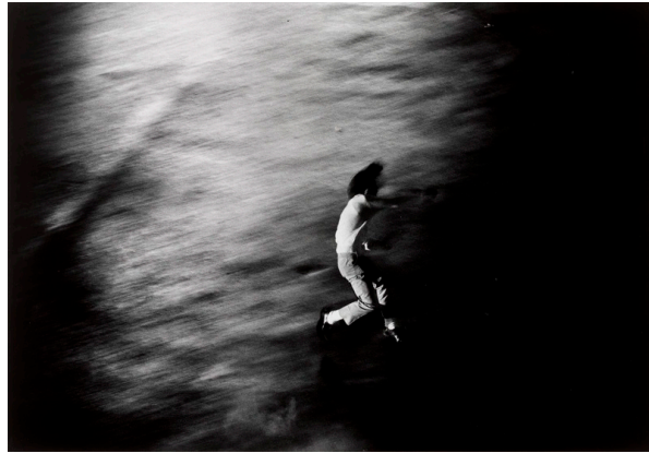
Tōmatsu Shōmei, Untitled from the Protest Series , 1969.