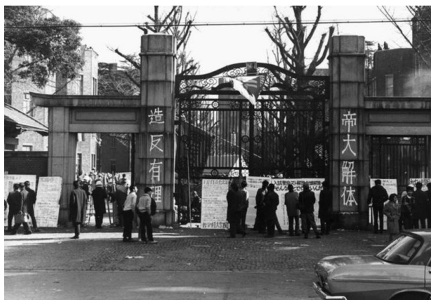
University of Tokyo, November 22, 1968.

University of Tokyo main gate graffiti: "Rebellion is rational," after Mao Zedong; "dismantle Imperial University."