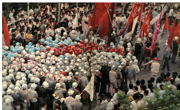
Protest on Hakusan-dōri, September 9, 1968.

The student protests that launched the Zenkyōtō movement in 1966 and 1967 made many concrete demands, including, for example, that tuition fees be lowered. But from the 1968 University of Tokyo uprising onward, students seemed far less interested in specific demands than in fighting for vaguely-defined goals such as "socialist revolution" or "university dissolution" that were convenient stand-ins for a barely-articulated process of self-formation. When asked what kind of university Zenkyōtō hoped to establish, one member replied, "All we want is the battle itself." xxxv At the University of Tokyo and elsewhere, Zenkyōtō activists repeatedly rejected any opportunity for compromise, with the result that they continued fighting resolutely until they were totally defeated and the police demolished their barricades.