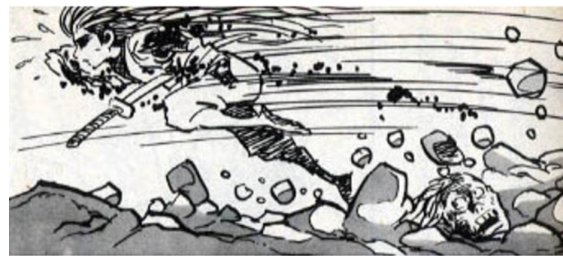
Tomorrow's Joe Star of the Giants Ninja Combat Manual