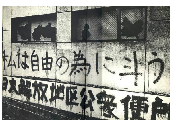
Graffiti at Nihon University, "I fight for freedom"; "Nihon University Liberated Zone Public Toilet."

The strategy of barricading and occupying universities relied on a longstanding image of universities being at a monastic remove from the everyday world-autonomous zones where the police and other external forces should not intervene. Fearing a backlash from the public and the university professoriat, police initially refrained from entering the barricaded campuses, and the student occupations of Tokyo and Nihon Universities lasted more than six months.