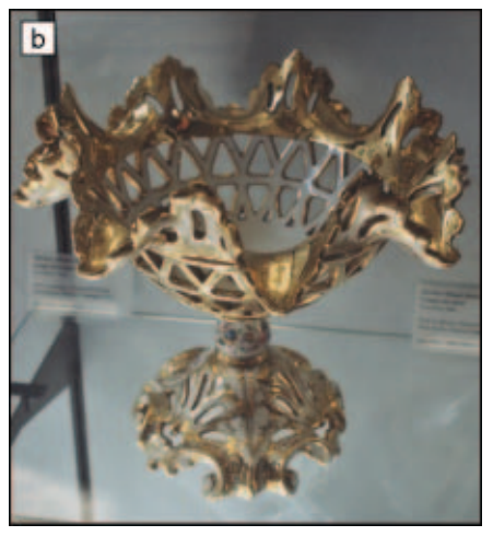
Figure 2. Examples of the high level of sophistication and artistry achieved in ceramic technology on the macroscale over the centuries. (a) Ceramic vase in the Kamares style from Phaestos, Greece, 1900–1700 BC (Archaeological Museum, Heraklion, Greece). Height, approximately 70 cm. (b) Limoges porcelain dish, France, 1834 AD (Adrien Dubouche Museum, Limoges, France.) Height, approximately 30 cm. Note that these two works are separated by an interval of almost 40 centuries.

sensors, and piezoelectric components. Such materials include oxides, carbides, nitrides, mixed oxides, and metal/oxide composites. Over the last decade, with the successful upscaling of their production, nanoceramics have been revolutionizing traditional materials design in many applications, by the tailoring of their properties via structural control at the atomic level. Some of the advantages of nanoceramics in various fields of application can be highlighted: