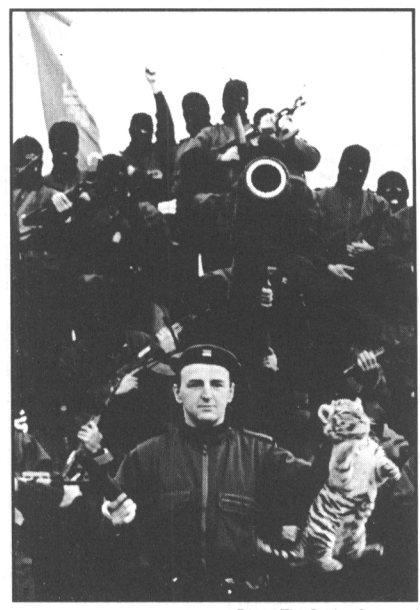
From The Bridge Betrayed