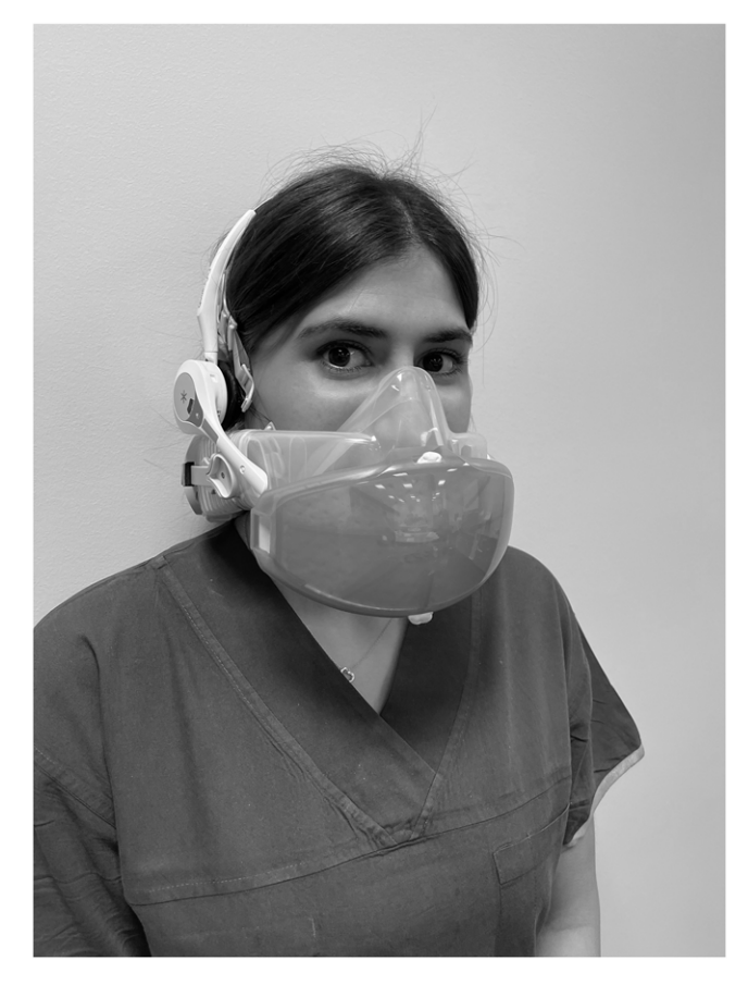
Fig. 1. A healthcare worker wearing a HALO CleanSpace powered air-purifying respirator and a wireless communication headset device.

The room setup was shown in Figure 2. A background noise in the frequency range of 20–50 kHz was transmitted through 2