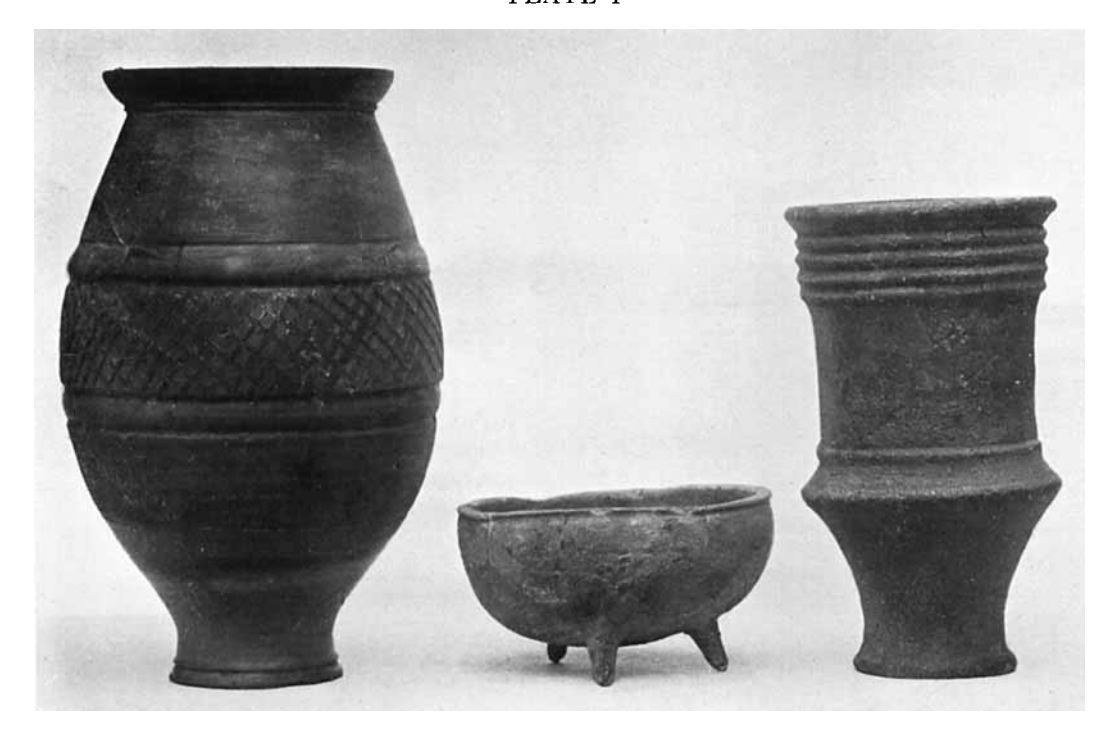
Fig. 1. IMPORTED AND NATIVE POTTERY OF THE EARLY 1st CENTURY A.D. COLCHESTER BY-PASS SITE, 1930