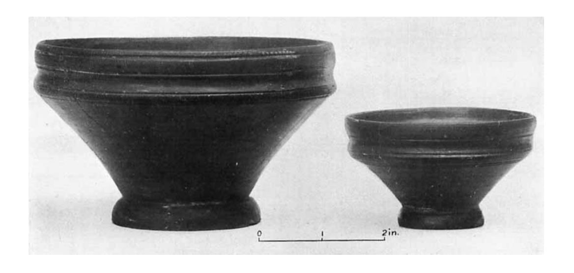
Fig. 2. TWO CUPS OF ARRETINE WARE BY THE POTTERS ATEIUS AND XANTHUS COLCHESTER BY\mbox{-}PASS SITE, 1930