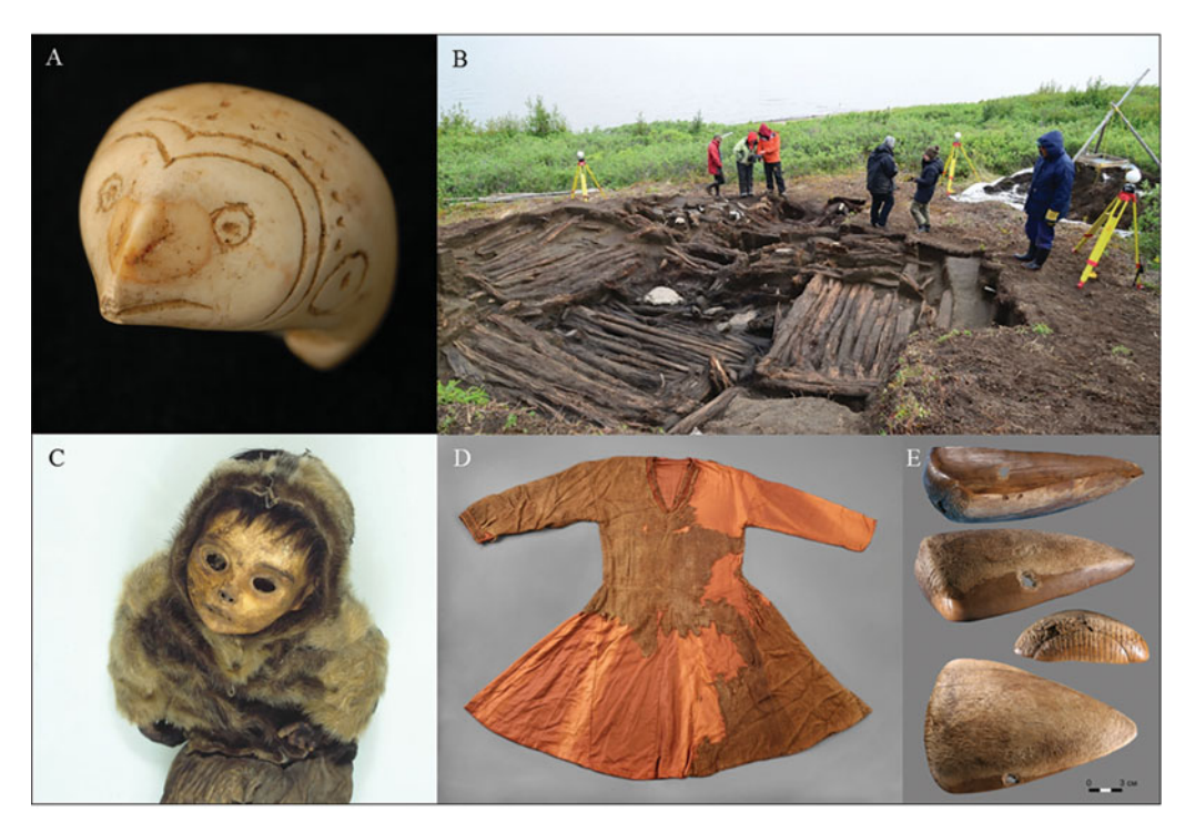
Figure 2. Examples of some of the extraordinary archaeological finds from the Arctic: A) ivory owl effigy toggle from Nuvuk, Alaska; B) pre-contact driftwood house floor from Kuukpak in the Mackenzie Delta, Canada; C) human remains from Qilakitsoq, Greenland; D) preserved medieval textiles from Andøy, Nordland, Norway; E) 31 000-year-old decorated ivory scoop from the Yana site, Arctic Siberia.