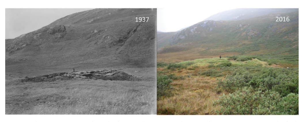
Figure 4. The project REMAINS of Greenland is currently investigating the impact of vegetation increase in Greenland. The use of historical photographs is one of the methods used to highlight changes in vegetation (photographs from Austmanndalen near Nuuk in west Greenland by Roussel (1937) and Matthiesen (2016)).

organic archaeological deposits is accompanied by high microbial heat production. In some cases, this increases soil temperatures, thereby accelerating the decomposition processes and intensifying significantly the impact of climate change (Hollesen et al. 2015).