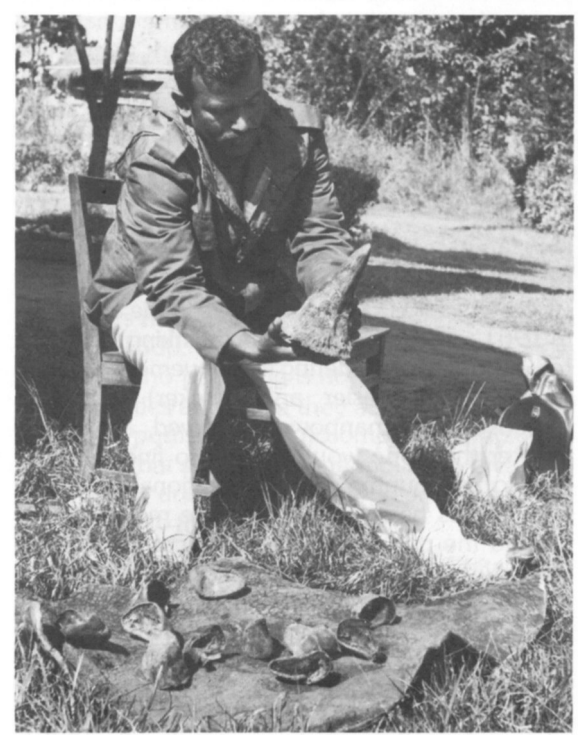
The Warden of the Royal Chitawan National Park examines the horn, hooves and hide of a rhino that had recently died of natural causes in the Park ( Esmond Bradley Martin ).

On the other hand, in the only known instance of rhino poaching in recent years in Nepal, the poachers received just $378 for a 250-gram horn—less than one-quarter of its wholesale value in Kathmandu. In January 1982 three of the poachers involved in this case were apprehended when they were attempting to hunt another rhino. I was permitted to question them and discovered that they had sold the horn of the animal they shot in April 1980 to a butcher in Nayarayanghat. Since it had been a successful venture, and as someone had promised a much