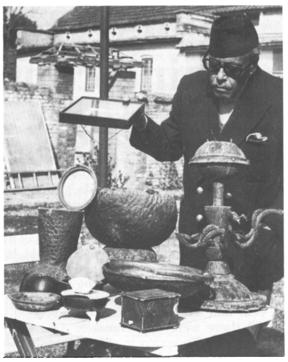
General Kiran Shumsher Rana, whose father was Prime Minister of Nepal, displays his collection of objects made from rhino hide of an animal he shot in 1938 for the Blood Tarpan religious ceremony (Esmond Bradley Martin).

Sometimes an old rhino carcass is discovered Even if it abounds with maggots and flies, it is nevertheless in demand by the villagers, although they will not touch the flesh from any other decaying animal. They arrive en masse , excitedly brandishing their knives all around the carcass, often inadvertently slashing one another in their haste. Rhino meat, which is usually cooked with mustard oil, sliced tomatoes and curry powder, is believed to confer immunity to serious diseases. Rhino liver is eaten to cure tuberculosis, dysentery and, occasionally, to speed up the elimination of after-birth. 12