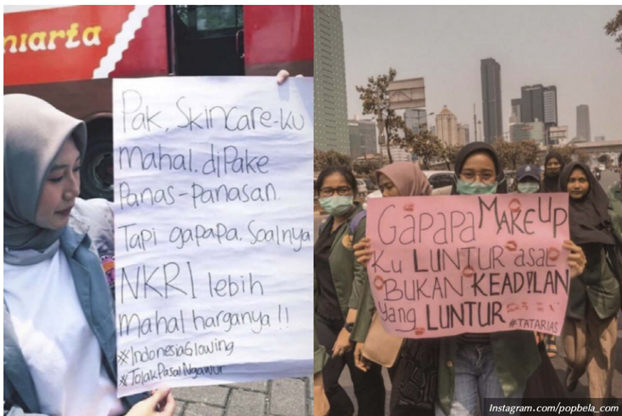
Figure 10. Collages of young women that circulated with versions of the phrase, "Mister, my skincare is expensive. Wearing it just makes me hotter. But I don't mind because NKRI is even more valuable"; or "I don't mind if my makeup wears off, as long justice never wears off," September 2019; @popbela.