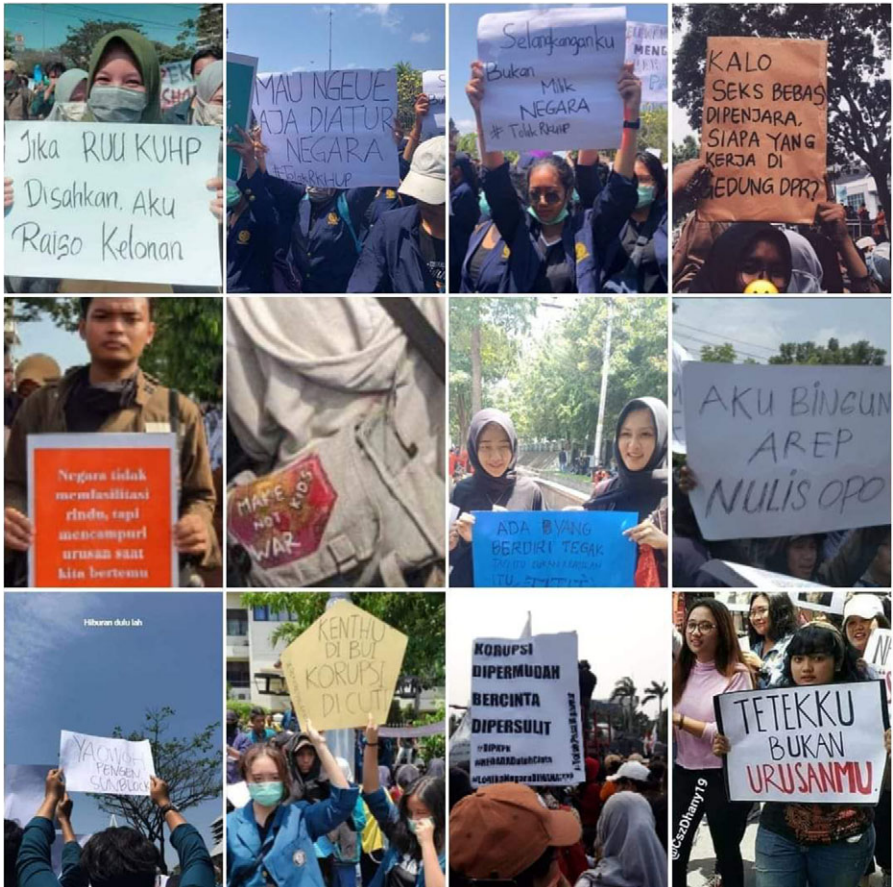
Figure 9. Collage of protesters' signs that circulated widely via WhatsApp in September and October of 2019.

Over six days of coordinated protests across the country, from 24–30 September (the last week of the parliamentary session), students tied their resistance, their demands, and their humor to the laws as a pair. By highlighting the hypocrisy of making private sexual life subject to state surveillance while making theft of public goods potentially more private and safer, protesters' aesthetics included consistent themes in their posters and dress styles. Their posters pointedly asked, "If extramarital sex results in imprisonment, who will be left to serve in the legislature?" "Making corruption easier while making love harder." "Sex gets you jailed. Corruption just gets you a vacation," and "Brokenhearted but still protesting." Many of the same phrases appeared at multiple protest sites, conveying the coordinated, viral strategy of what was also a national resistance movement known as Aliansi Rakyat Bergerak (People's Movement Alliance), (see figure 9).