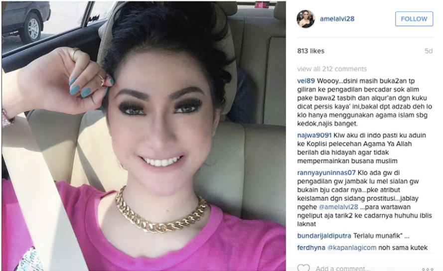
Figure 3. Celebrity entertainer Amel Alvi in selfie taken the evening before her trial, 30 September 2015; @amelalvi28.