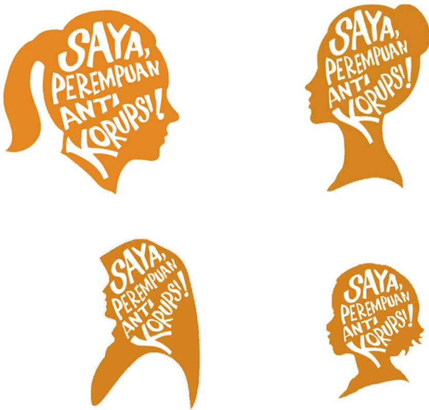
Figure 11. A selection of profiles of women's heads in profile designed to invite everyday Indonesian women to recognize themselves as participants in efforts to fight corruption. At http://www.spakindonesia.org (accessed 3 July 2022, but it is no longer online).