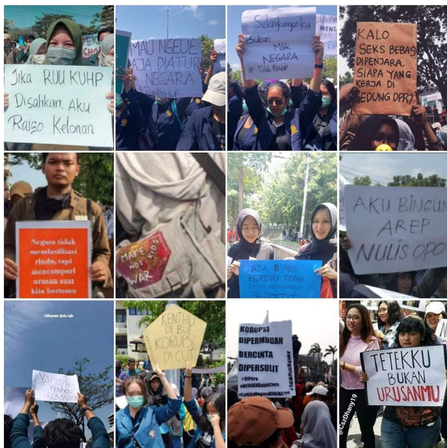
Figure 9. Collage of protesters' signs that circulated widely via WhatsApp in September and October of 2019.

Over six days of coordinated protests across the country, from 24–30 September (the last week of the parliamentary session), students tied their resistance, their demands, and their humor to the laws as a pair. By highlighting the hypocrisy of making private sexual life subject to state surveillance while making theft of public goods potentially more private and safer, protesters' aesthetics included consistent themes in their posters and dress styles. Their posters pointedly asked, "If extramarital sex results in imprisonment, who will be left to serve in the legislature?" "Making corruption easier while making love harder." "Sex gets you jailed. Corruption just gets you a vacation," and "Brokenhearted but still protesting." Many of the same phrases appeared at multiple protest sites, conveying the coordinated, viral strategy of what was also a national resistance movement known as Aliansi Rakyat Bergerak (People's Movement Alliance), (see figure 9).