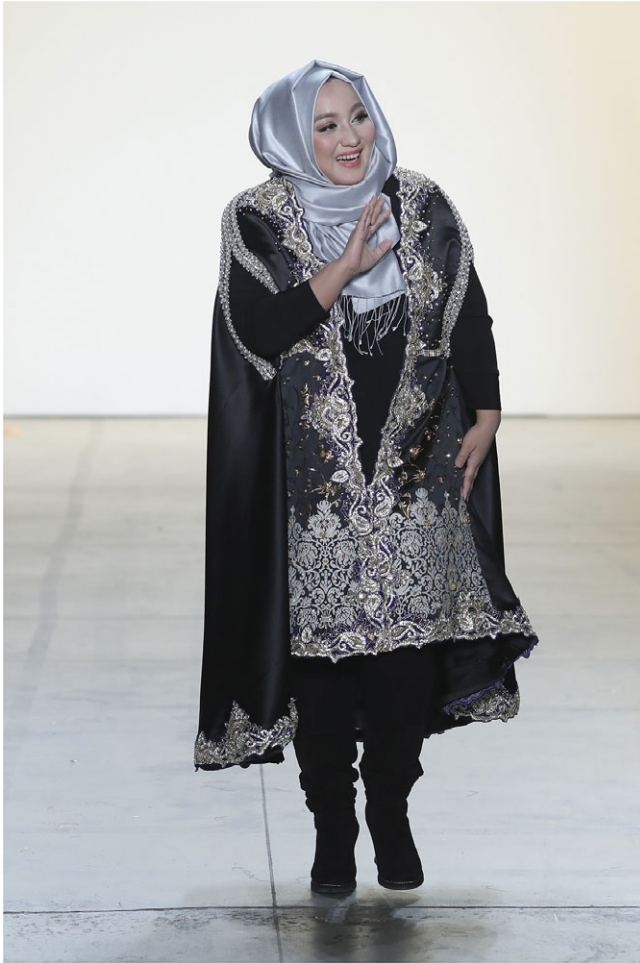
Figure 1. Anniesa Hasibuan walking the runway at the end of her 14 February 2017 fashion show at New York Fashion Week.