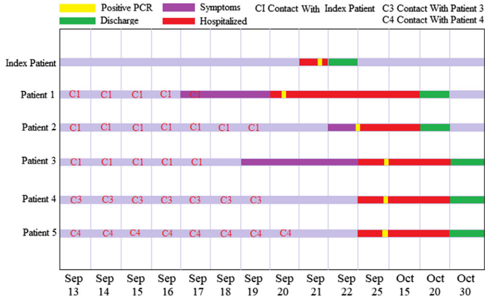
Figure 1. Timeline of exposure to an index patient with COVID-19 infection in the familial cluster case in Libya.