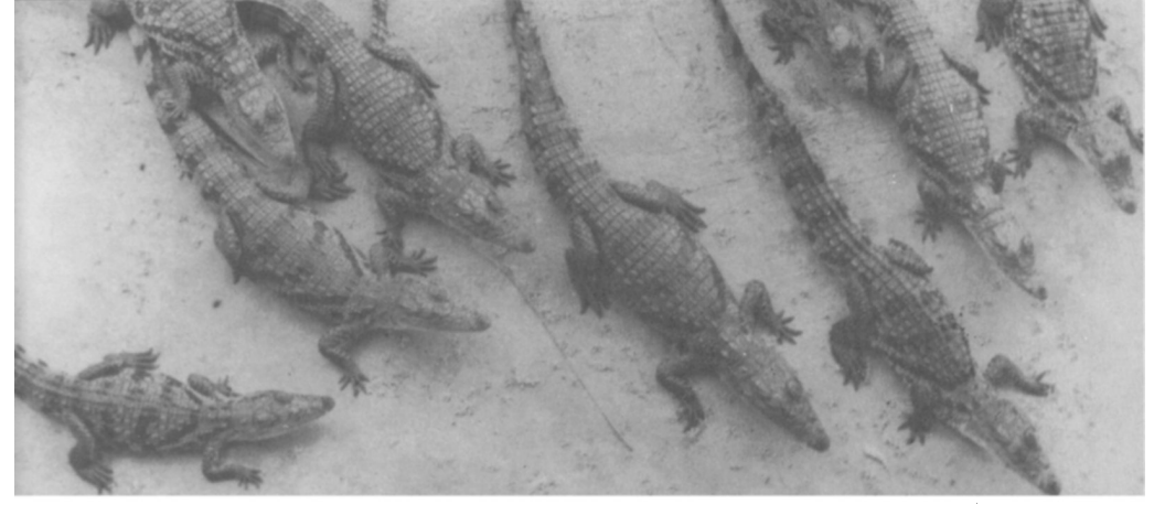
NILE CROCODILES born in the Kyarimi Park Zoo and released in the Gashaka Game Reserve

river, which traverses the Gumti Game Reserve, also in Gongola State. This would greatly reduce the danger of any of these smaller animals being washed down into the main waters of the Yim before they had 'acclimatised' themselves to the rigours of their new natural environment. After nearly two days on the road, mostly on rough, undulating dirt tracks through heavy Guinea savanna, the 20 crocodiles were finally released into Mbelagenagge, a secluded three-hectare lake that is the headwaters of a small stream that flows for about 10km through heavy gallery forest before it reaches the Yim. The abundance of feed, the isolated location of the lake, and the fact that its outlet to the Yim river is not liable to major seasonal flash floods make it an excellent refuge for young crocodiles until they are old enough to enter the main flow of the Yim of their own accord.