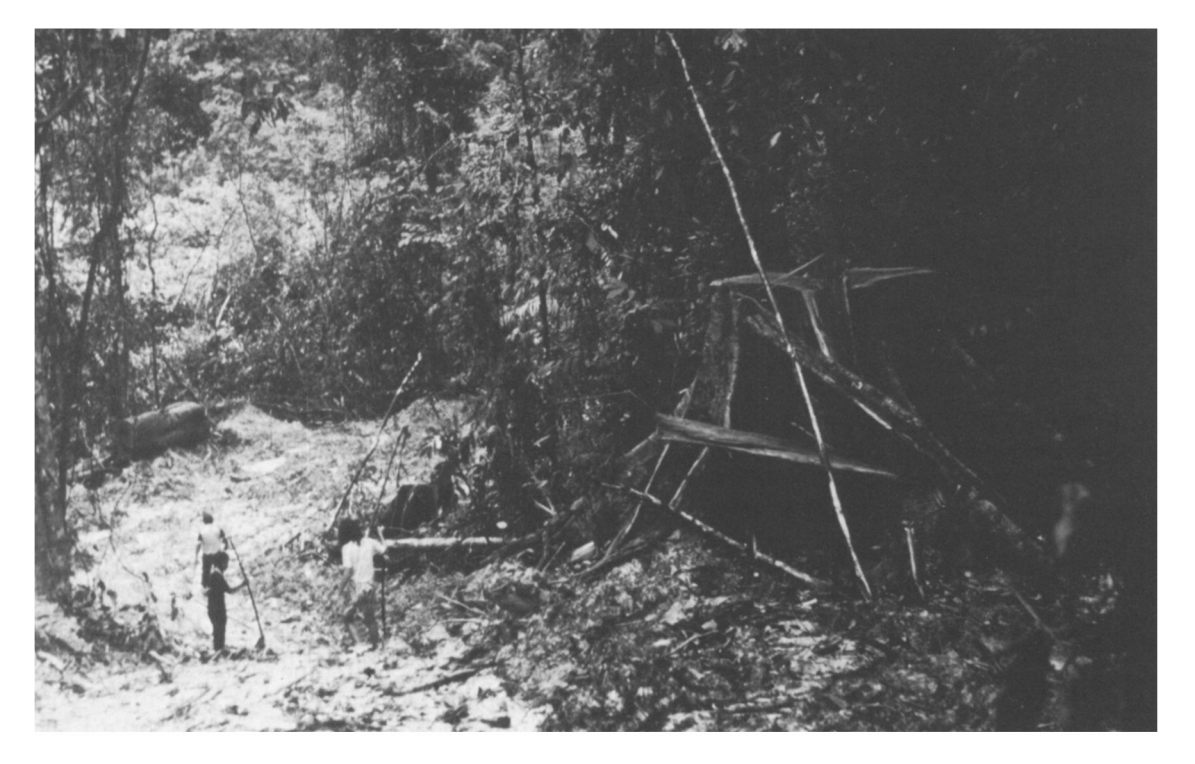
Damage from commercial logging is a major threat to Palawan's forests (J. Wood). Oryx Vol 22 No 1, January 1988

Palawan is regarded as a major source of exotic birds in the USA (FORI-PIADP, 1983). Hunting, both for the pot and the bird trade, may have locally reduced the numbers of Palawan peacock pheasant around Puerto Princesa, the island's capital. Local prices in 1984 were P150 ($8) per bird. At present, peacock pheasants are still reasonably common away from population centres, but their continued survival over most of the island would seem to depend on their ability to adapt to areas of logged forest and secondary