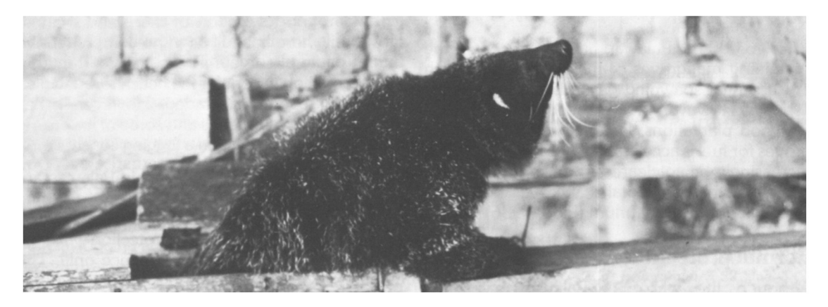
Binturong are threatened locally by the pet trade and by hunting (R. Quinnell).

growth (King, 1981). Studies are currently under way on their habitat requirements and population densities.