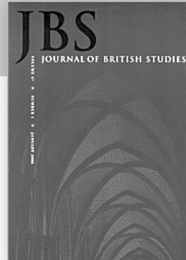
Journal of British Studies http://journals.cambridge.org/jbr

For more information, please go to http://journals.cambridge.org/JBritStud