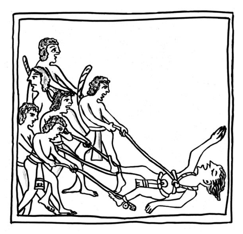
FIGURE 2 Toltecs Dragging the Corpse of Tlacahuepan