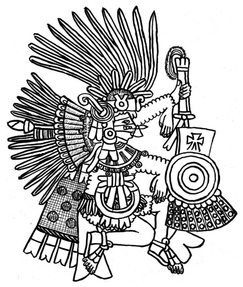
FIGURE 1 Xipe Totec Wearing Flayed Yellow Skin, the Sapota Skirt and the Headdress of the Roseate Spoonbill Feathers

Source: Codex Borbonicus (1980) Códice Borbónico. Manuscrito mexicano de la biblioteca del Palais Bourbon (Libro adivinatorio y ritual ilustrado), Mexico, Siglo XXI, f. 14, redrawn by Katarzyna Szoblik