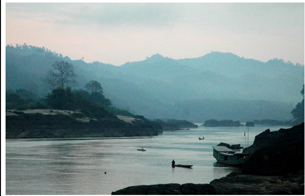
Site of the proposed Xayaburi Dam

A telling case is underway whose outcome will demonstrate whether or not the cooperative arrangement represented by MRC will take note of the SEA as the most comprehensive scientific assessment to date. The first of the mainstream dams, Xayabouri, was notified by Lao PDR for prior consultation by MRC member states over a six month period to April 2011. This is the first time that other MRC countries have been asked to give their opinions on a dam proposed in the territory of one of their neighbours. Xayabouri is a Thai project inside Laos, whose lead contractor is the Thai company Ch. Kanchang, whose financing would be mainly by Thai banks, and whose market for power is primarily in Thailand. On 19 April, the Joint Committee of MRC held a special meeting to decide what position to take on the dam. The outcome of the meeting was that the countries agreed to disagree , based on concerns expressed both in technical reviews of the dam proposals and a series of public consultations, at which strong opposition to Xayabouri and other mainstream dams was expressed. The matter was referred upward to the Ministerial Council level, effectively putting the dam in abeyance.