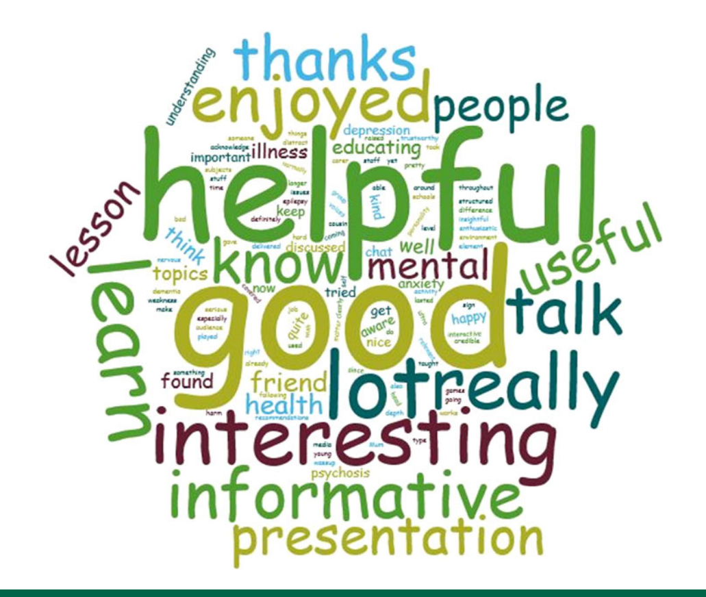
Fig. 3 Word cloud representing positive pupil feedback.

Teachers gave three pieces of negative feedback. All three centred on lesson delivery and two of these were from one lesson where they felt that the tutor lacked confidence and was not well prepared. This was the same lesson as the pupils had commented on negatively above. The final comment concerned a misunderstanding in communication. When the pupils' qualitative feedback was linked to the quantitative feedback, 4 out of the 13 comments