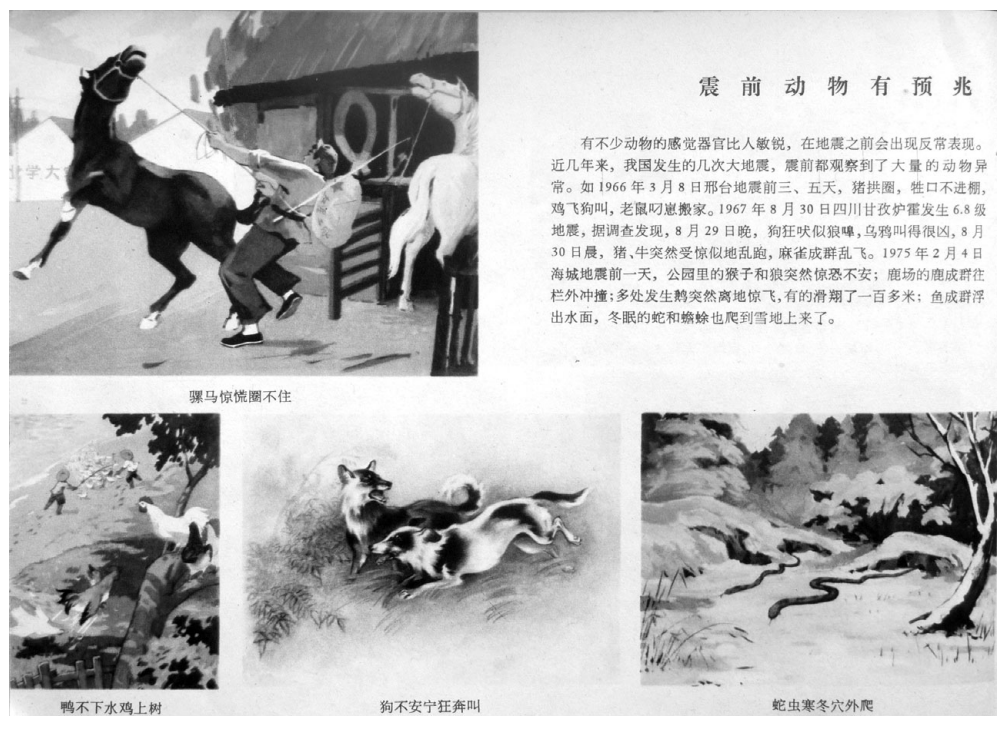
Fig. 3. The pictures show how animals might exhibit precursory warnings of an earthquake. Horses might become difficult to control; ducks refuse to go in the water, and chickens fly up to the trees; dogs bark wildly; and snakes wake up from hibernation and crawl out of their hiding places.

parrots, ducks, mice, rabbits, fish, and snakes seemed all able to detect and respond to minute changes before an earthquake (fig. 3). One frequently cited example was the bizarre behavior of snakes in the weeks before the Haicheng earthquake in 1975. There were witness accounts of snakes crawling out of their hibernation holes in the February cold of North China and freezing to death (Zhongguo kexueyuan shengqu wulisuo dizhenzu 1977, 66–67). Some described vivid images of snakes struggling to come out despite the fact that their front halves were already numb in the cold. Burrowing animals were believed to be particularly sensitive to changes underground. However, live stock and other animals that most people came in contact with every day could also serve as convenient instruments. A widely circulated rhyme on animal behavior and earthquake prediction says: