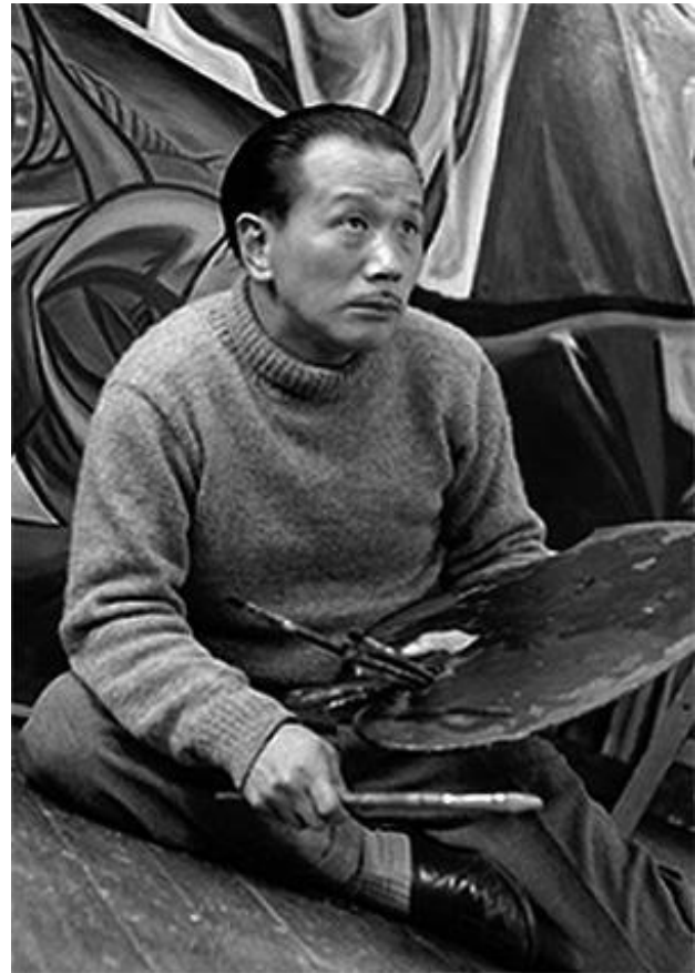
Fig. 1. Okamoto Tarō pictured in 1953.

The way in which Okamoto wrote about the Jōmon nevertheless contained an inherent ambivalence. His ideas could nurture a new critique of Japanese identity or they could renegotiate the old tradition that had been tainted by the war. As with all ideologies, both could happen at the same time. In the 1950s, architect Tange Kenzō (1913-2005) became the most influential public figure to build on the radical idea of Jōmon and Yayoi as two contrasting elements of the Japanese past, elements which could now be employed to shift the negative associations of Japanese tradition away from nationalism and imperialism. Tange's wartime projects had already attempted to go beyond Western modernism through the incorporation of classical Japanese