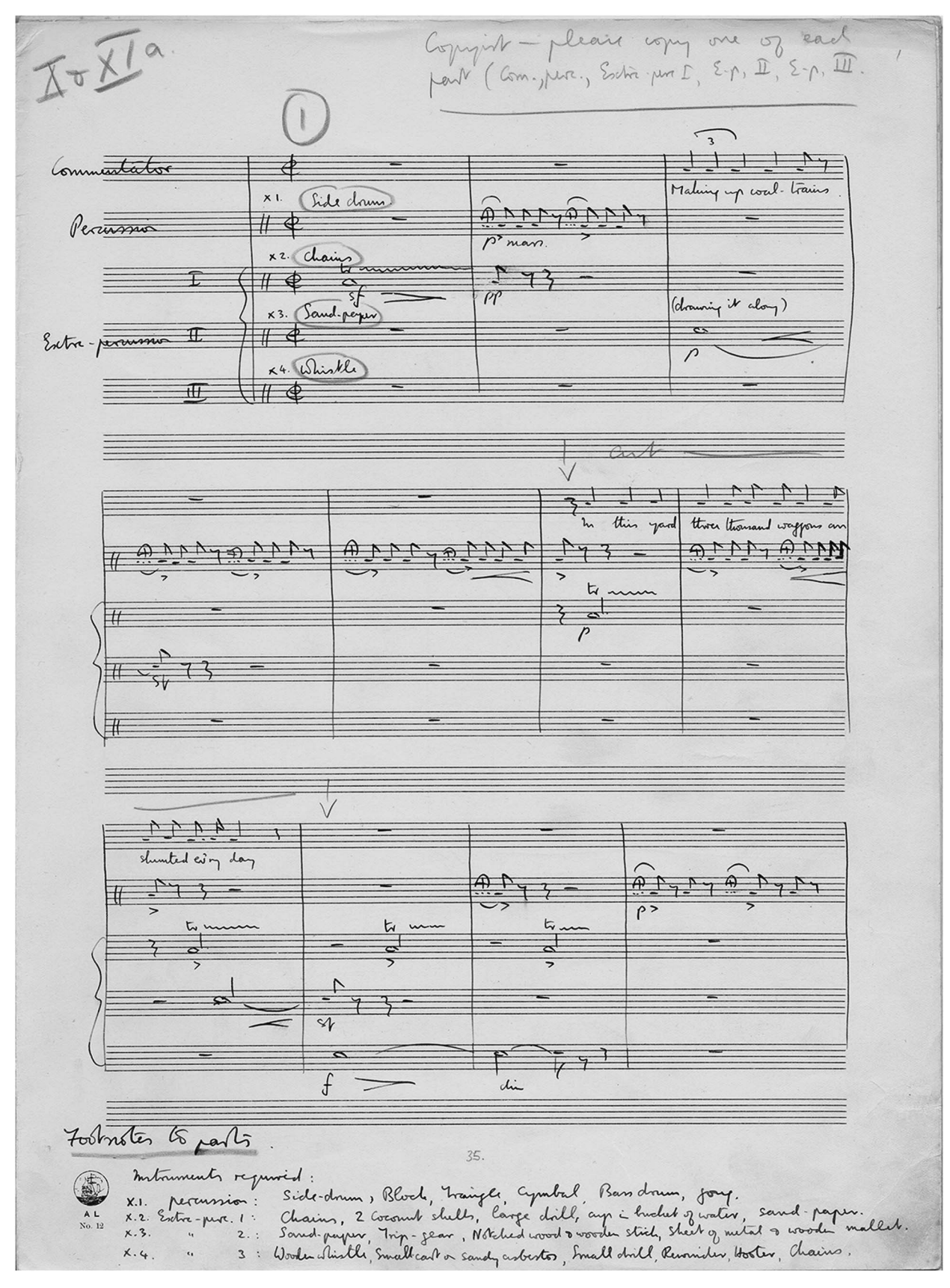
Figure 1. The first page of section X of Britten's score for Coal Face followed by pages 181–184 (Figures 2–5). The voice-over is detailed in the first line of the score (complete with rhythmic notation) and the make up of the percussion ensemble at the bottom of page 1. The 'Percussion' line comprises more conventional instruments whilst the three lines of 'Extra percussion' form the noise ensemble. Required percussion or noise instrument changes are indicated by circled annotations (marked in red on the original).