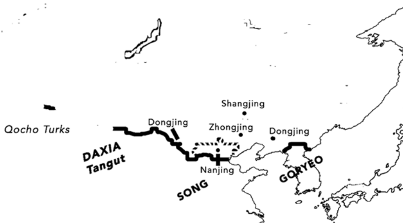
Figure 1. Map showing Kitan Liao space as suggested by Liao shi . Source: The author.