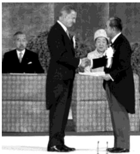
Emperor Hirohito and Empress Nagako in Tokyo look on as US Vice President Spiro Agnew presents Japanese Prime Minister Eisaku Sato with documents returning Okinawa to Japan.