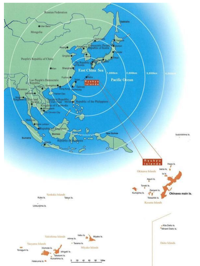
(Map by Executive Office of the Governor, Okinawa Prefecture)

Okinawa's chain of islands—around sixty of them inhabited and many more not—stretch for 1,100 kilometers (683 miles) along the Western Pacific between Japan's Kagoshima