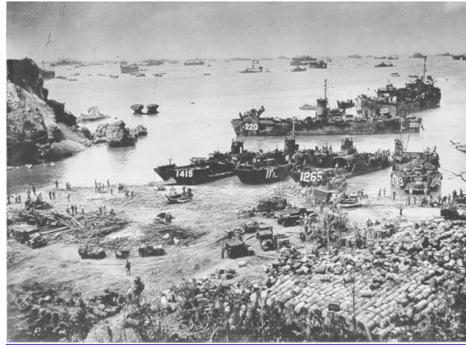
Americans landing in the Battle of Okinawa

substantial US military presence in Okinawa. To prevent any significant reduction of US forces ever taking place, it began to pay a sum that steadily increased over the years.