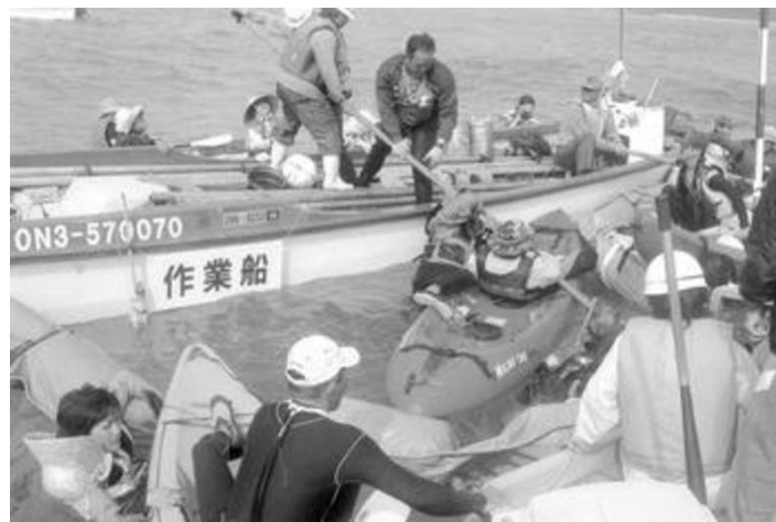
(Struggle between government survey ship and protesters in canoes, November 2004. Photo by Toyozato Tomoyuki)

Okinawans tend to look back and see the four hundred years of their troubled premodern and modern history in terms of successive shobun , or “disposals,” by superior, external forces depriving them of their subjectivity, with militarism their peculiar bane—under Satsuma from 1609, the modern Japanese state from 1879 to 1945, direct US military rule from 1945 to 1972, and nominal Japanese rule after 1972. Though helpless to avoid or resist past disposals, from 1996 the balance shifted. Okinawa gradually has come to play a major, if rarely acknowledged, role in the regional and global system. It became a state of resistance.