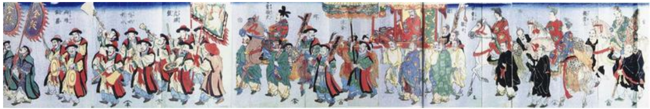
1832 Ryukyu mission to Edo