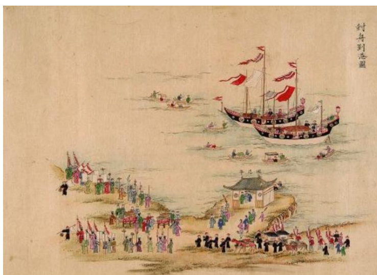
Images of Ryukyu Tributary relationship with China.

The curtain did not ring down on this peculiar state till the mid-nineteenth century. For a brief period then, the omens for Ryukyu seemed good. Left more than usual to its own devices as the crisis in the Japanese Edo order deepened, Ryukyu courts negotiated modern “opening” treaties, as an independent kingdom, with the Americans, French, and Dutch (in 1854, 1855, and 1850). 3