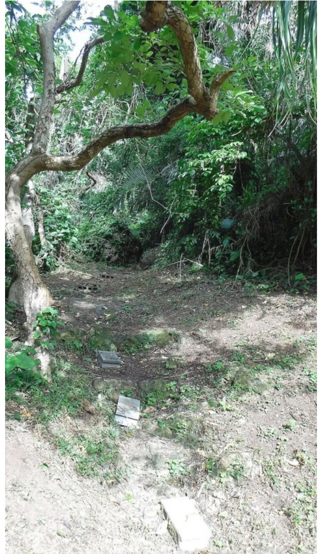
Path to the tomb of Shō Hashi in Yomitan

Shō Kinpuku's 尚金福 (r. 1450-1453) tomb is in Urasoe 浦添, north of Naha [C], but the remains of his younger brother, Shō Furi 尚布里 (dates uncertain) are in Fusato 富里 [D] near the Chinen Peninsula in southeast Okinawa. Shō Furi went to war with Kinpuku's son, Shō Shiro 尚志魯 (d. 1453 or 1454). This uncle-nephew war resulted in the destruction by fire of much of Shuri castle and the deaths of both parties, at least according to the official story. Archaeological evidence confirms severe castle damage, but the details of who was at war with whom and what exactly happened are