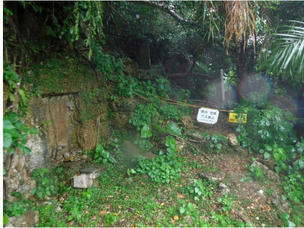
The tomb of Oni-Ōgusuku lies beyond the sign warning of falling tree danger

1445-1449) are buried far away in Yomitan 読谷 [B] in central Okinawa.