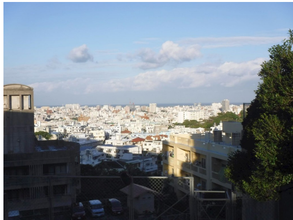
View of Naha from near the tomb of Shō Toku

Taikyū was almost certainly born in Goeku 越來 in central Okinawa, a son of the local warlord, and initially he was entombed in that area. However, his bones were moved several times, and in 1910 ended up far away, in Fusato [E] near Furi's tomb. Taikyū's daughter Momoto-fumiagari 百十踏揚 (d. ca. 1469-70), acclaimed in Omoro songs as a potent shamanic dancer, resides slightly north of Fusato, in Tamagusuku [F]. However, the remains of her husband, the powerful warrior Oni-Ōgusuku 鬼大城 (d. ca. 1469) are at Chibana Castle 知花城 [G] in the Goegku area, the homeland of Shō Taikyū. The last king of the dynasty, Shō Toku 尚徳 (r. 1461-1469), is portrayed in the official histories as both evil and fond of warfare. Such is the reputation of last kings in Confucian histories. His tomb is in the Uema 上間 district [H] on the outskirts of Naha, commanding a splendid view of the city below.