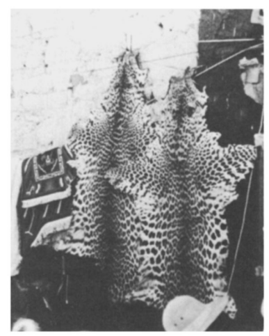
Leopard skins on sale in a market in Lhasa, Tibet, The export of these skins is banned under CITES.