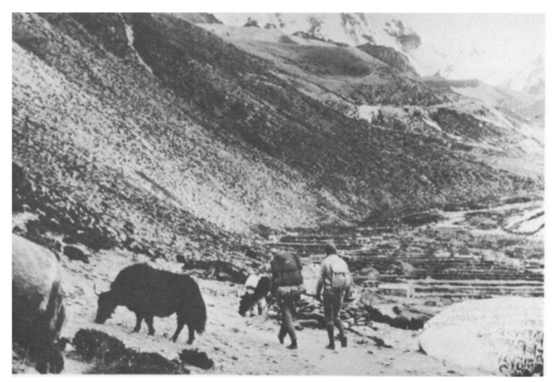
Trekking tourists in the Annapurna Conservation Area will be better managed in future to protect the fragile ecosystem.

Vietnam's National Conservation Strategy is going into effect. The Prime Minister has officially endorsed one of its key recommendations, the establishment of a National Board for the Conservation of Nature. Two immediate measures to rehabilitate the country's ravaged environment are a large-scale family-planning programme and a