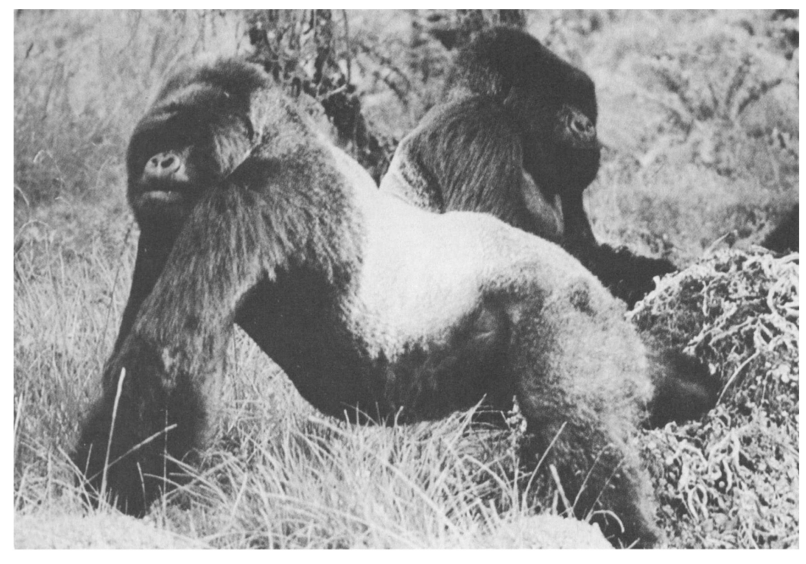
Adult male mountain gorillas in Volcanoes National Park, Rwanda. See 'Cards for Gorillas' below.

Central African States for Wildlife Conservation, with headquarters in Khartoum, the Sudan. The group has signed two agreements—one for cooperation and consultation, and another to create a fund for wildlife conservation, which will be maintained through proceeds from the sale of specimens seized in member states. TRAFFIC (USA), 7, 1.