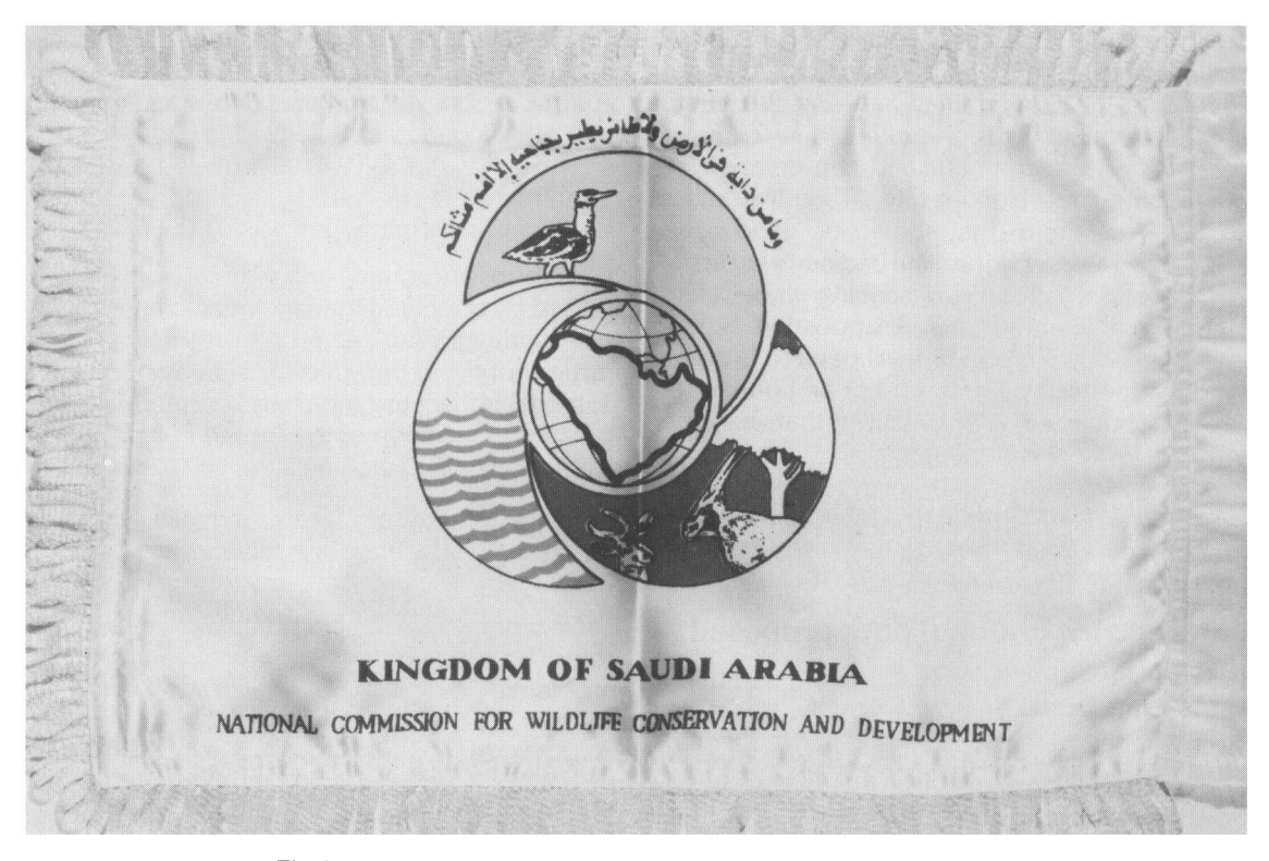
The flag designed for Saudi Arabia's conservation symposium in February 1987.

were a major preoccupation at the symposium. Inevitably the details of their management, captive breeding and health problems also received a high profile.