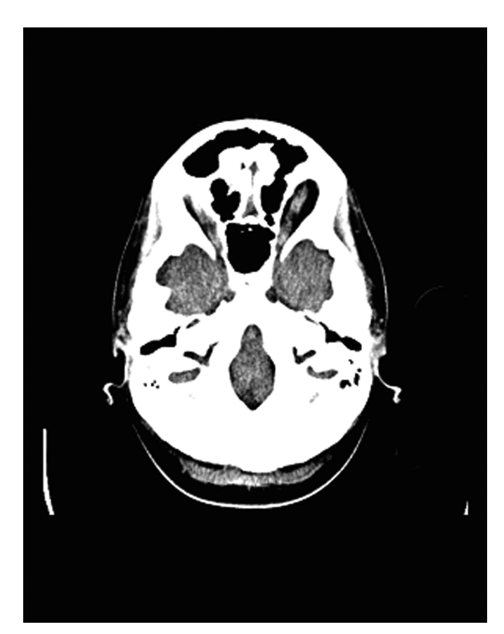
Figure 1: Axial computed tomography scan of the patient with osteopetrosis. Thickening of the bones at the skull base was observed but the optic canals do not appear significantly stenotic.