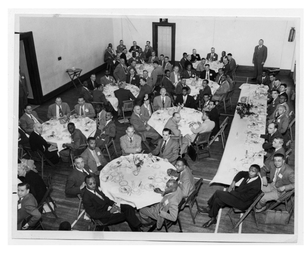
Figure 6: With its gradualism and Christian and democratic rhetoric, talk-first activism bloomed during the early Cold War. "Commission on Interracial Policies, National Board YMCA, Philadelphia, Pennsylvania, June 10–11, 1949,"