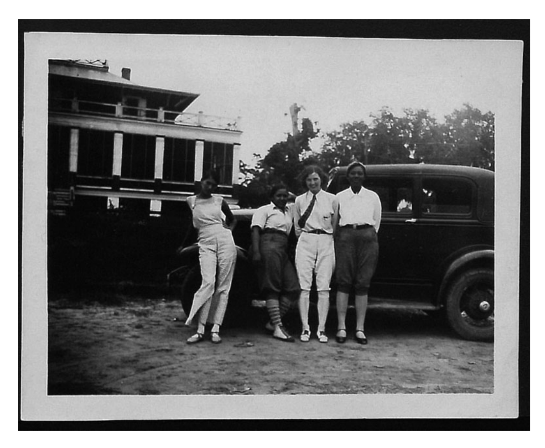
Figure 2: In the 1930s, student YMCAs and YWCAs pushed their parent institutions to embrace desegregation.