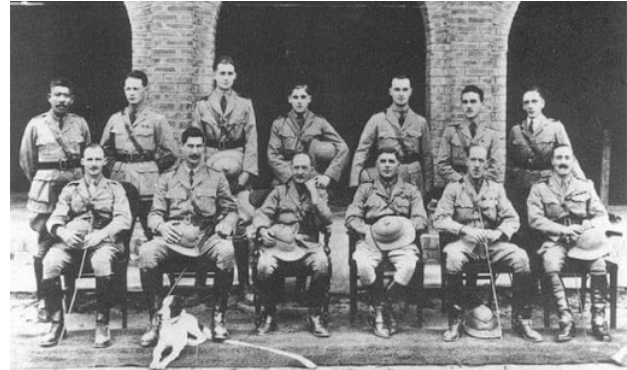
Figure 2: George Orwell (back row, third from left) doing his police training in Burma in 1923.