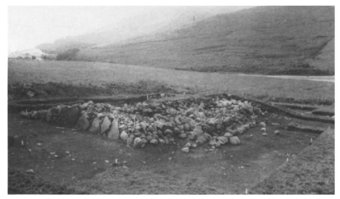
PLATE XIIIb: THE LOCHHILL LONG CAIRN. Stone façade and cairn, from N See pp. 96-100