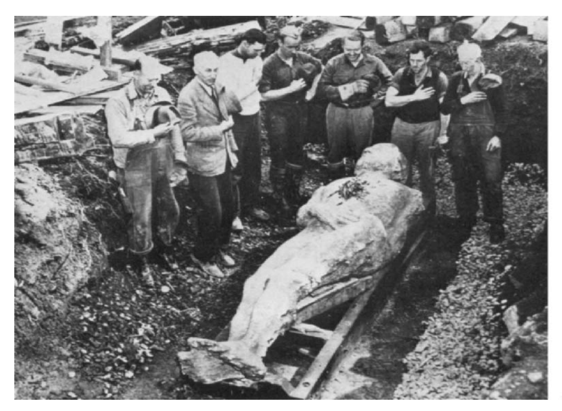
PLATE XIII a: EDITORIAL. The Cardiff Giant transported to the Farmers' Museum, Cooperstown See pp. 89-90