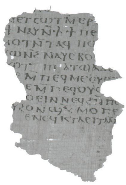
Figure 2 Fragment 1 against the fibers (53.19–29) = NHC 1,3 30.27–31.1

Appendix II: Images of the Fragments from Codex XII