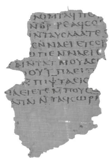
Figure 3 Fragment 1 with the fibers (54.19–28) = NHC 1,3 31.25–32.2