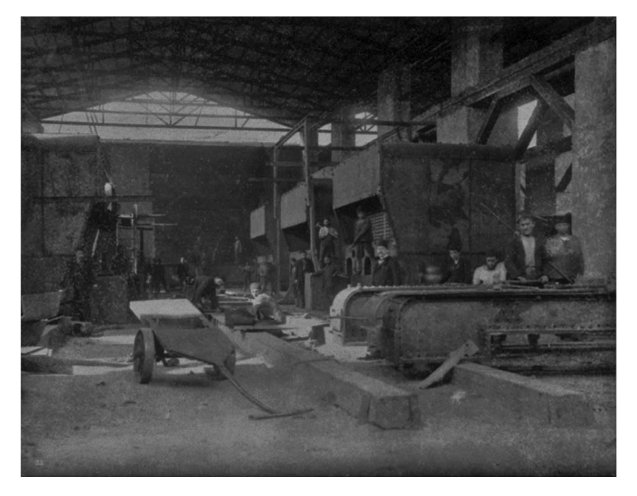
Figure 1. Workers in the boiler shop in the late nineteenth century. Workers were distributed throughout various workshops and factories in the Imperial Naval Arsenal.

This was especially the case during the reign of Sultan Abdulaziz (1861–1876), whose pursuit of the ambitious project of creating one of the world's largest navies placed the Arsenal at the very center of this endeavor. In 1871, the ironworks employed 284 workers, the machine factory 257, and the repair factory 347. Besides factory workers, there were also sizeable numbers of workers in artisanal jobs, such as carpenters, masons, tinsmiths, and painters, as well as lesser-skilled laborers, including porters and construction workers.8 The size of this working community dramatically decreased after the severe economic depression of the mid-1870s. Nevertheless, civilian workers remained central to the production process throughout the following decades.