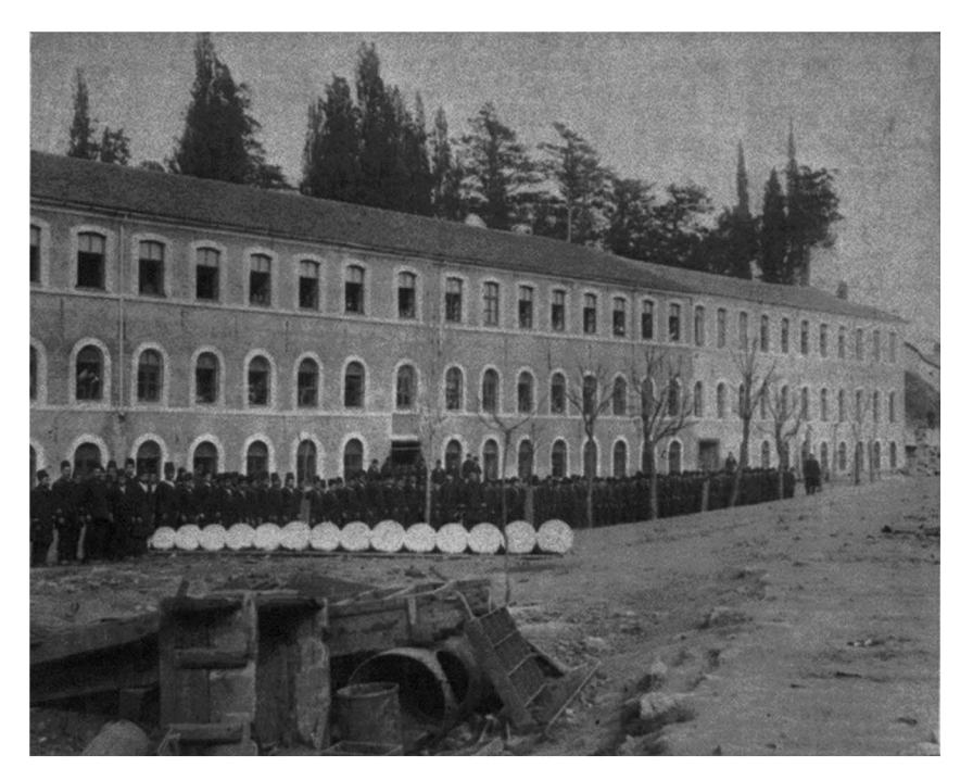
Figure 3. The Boys' Battalions were introduced to overcome the problems associated with the militarization of labor in the Naval Arsenal.