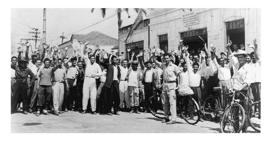
Figure 3. The so-called Strike of the 400,000 in 1957 was an important moment for the strengthening of the ties of unity between the SABs and trade-unions. Many picket lines were organized in the neighborhoods.