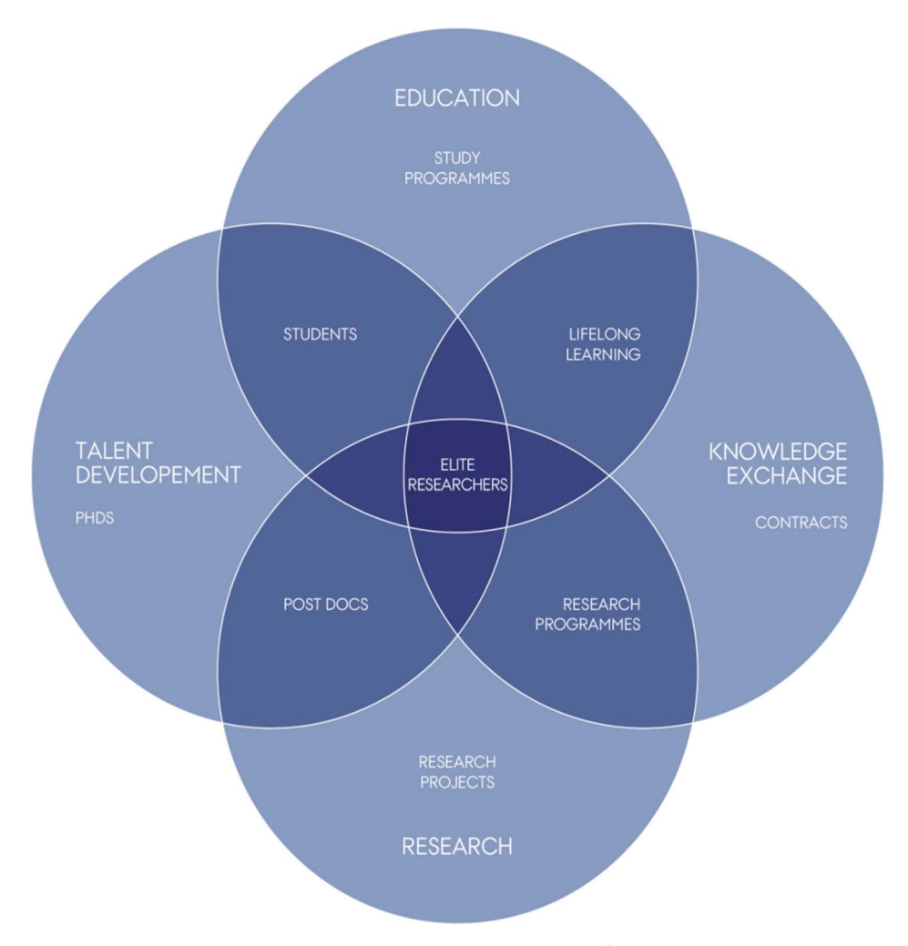
Figure 2. The quadruple helix of Aarhus University.<sup>28</sup>

dramatically. Today, in many academic fields, the norm has become teams of professors. The leadership in such teams changes over time, and individuals enjoy differentiated degrees of freedom to choose their research objectives, although the freedom to choose research methods in general is high.