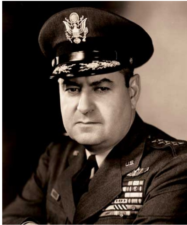
Curtis LeMay. Source

There are abundant corroborations for this alarming standoff between the president and his Joint Chiefs. Daniel Ellsberg, who worked in the Pentagon in 1964, told David Talbot that after the Cuban Missile settlement “there was virtually a coup atmosphere in Pentagon circles ... a mood of hatred and rage. The atmosphere was poisonous, poisonous.” 13 Disagreements over how vigorously to pursue the Vietnam War later divided President Johnson from many of his generals, split his party, and finally persuaded LBJ not to run for re-election.