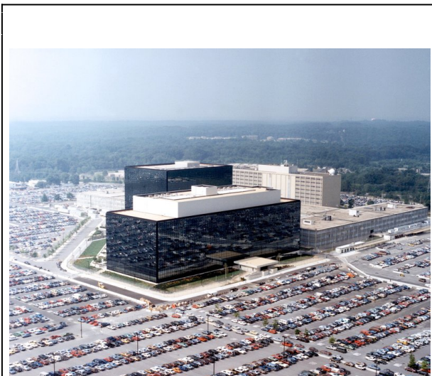
National Security Agency. Source

conservatives; in foreign policy, doves versus hawks. (Yet American liberals when they reach power, such as Hillary Clinton and John Kerry, have also been deeply entwined in the militarization of American politics and its global expansion.) But with the recent expansion since 9/11 of extra-constitutional agencies like the NSA, it is time to supplement these horizontal distinctions with a vertical one: between those agencies constrained by constitutional checks and balances (the public state) and those not so constrained (the deep state). Although the deep state as we have defined it has always existed, its recent radical expansion has brought it into occasional conspiratorial conflict with the public state, even with the president.