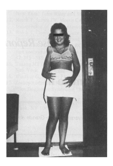
Fig. 1. M.J.C., the twin who has complete paraxial hemimelia in her right arm.