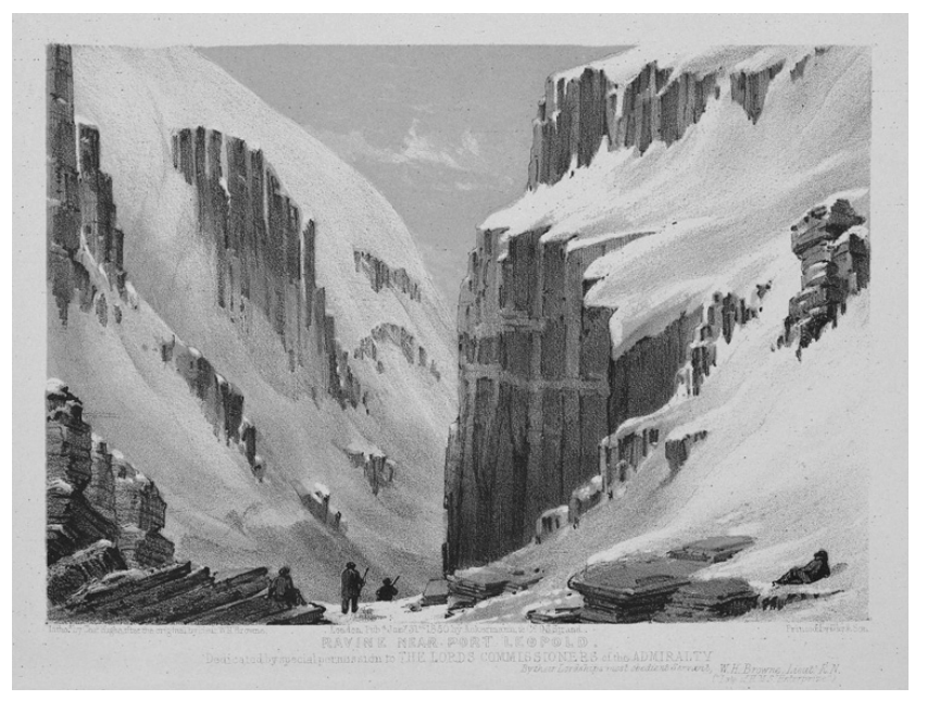
Figure 5.4 William Henry Browne, Ravine near Port Leopold , 1850. Lithograph, 12 × 17.5 cm.

Few of Browne's lithographs show the struggle that becomes more pronounced in the later lithographs of Cresswell and May, where the heroic self-sacrifice of the search is made clear. Certainly, the figures at ease in the environment in Coast of N. Somerset – Regent's Inlet , and in some of Browne's lithographs, would seem to suggest contemplation rather than action. Nowhere is this more evident that in the lithograph Ravine near Port Leopold (Figure 5.4). The seated figure on the left is offset by a reclining figure in the right-hand corner, who contemplates the scene in a Romantic