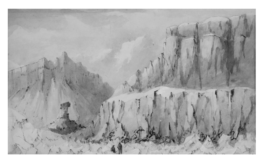
Figure 5.3 William Henry Browne, Coast of N. Somerset – Regent's Inlet, near Cape Leopold, 1849. Watercolour, 20.5 × 34.5 cm.

In contrast, the lithograph Prince Regent's Inlet (Figure 5.2) shows a very different scene.<sup>57</sup> At first glance, the watercolour and the lithograph appear to have little in common apart from the place name in their titles. On closer inspection, it becomes evident that the lithograph is compositionally almost a mirror image of the watercolour and may also present the view from a different angle. Noticeable too is the way in which enormous quantities of snow lie heaped up in the lithograph, in contrast to the relatively light layers of snow in the watercolour. The blue sky of the watercolour has disappeared, replaced by a stormy and ominous backdrop,