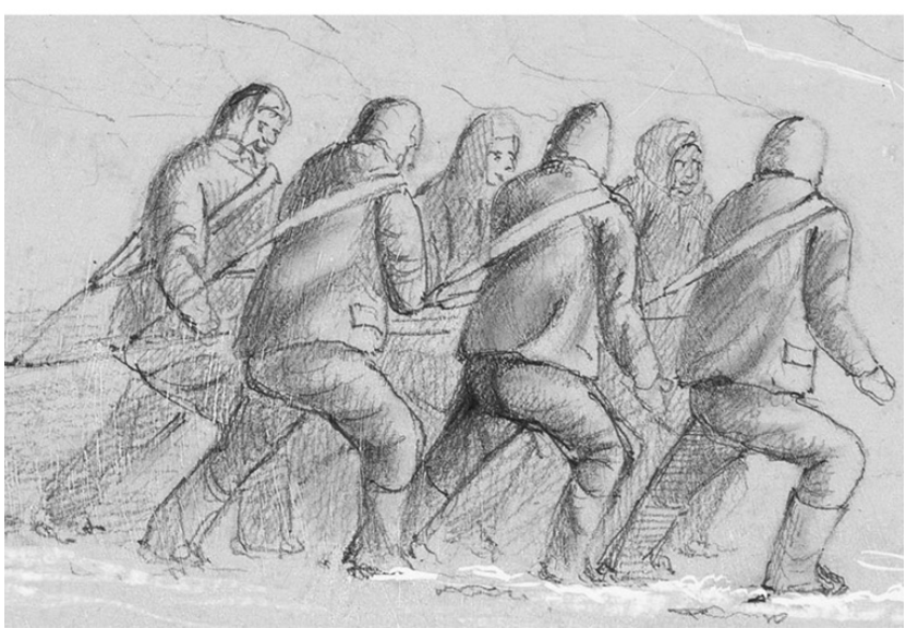
Figure 5.8 Detail from Walter William May, Loss of the McLellan, 1852. Watercolour; pen and ink (top). Detail from Walter William May, Cape Lady Franklin, 1852/4. Graphite (bottom). © National Maritime Museum, Greenwich, London.