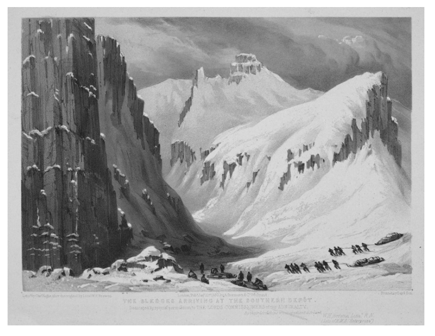
Figure 5.2 William Henry Browne, Prince Regent's Inlet , 1850. Lithograph, 24.5 × 17 cm.

of these scenes, of a very striking kind', singling out The Bivouac as an example. ^{52}