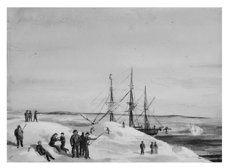
Figure 5.5 Samuel Gurney Cresswell, Brown's Island, Coast of America , August 1850. Watercolour, 18.2 × 25.5 cm. © Norfolk Record Office, Norwich.

In contrast to the lithographs, one of Cresswell's paintings from the voyage, Brown's Island, Coast of America (Figure 5.5), shows men scattered about in a relaxed manner under a blue sky in August 1850.72 The painting reflects the periods of inactivity that were inevitably typical of search expeditions. In the foreground of this painting, a figure reclines (bottom left) while, nearby, two sailors light their pipes; other groups of men stand around, close to the partly concealed ship. The scene has an air of quiet joviality and restfulness, not commonly seen in the public representations. The lithographs instead highlight discovery and difficulty, new lands, and the ship in peril. The first lithograph in the series immediately opens with a 'discovery'. First Discovery of Land by H.M.S. Investigator, September 6th 1850 (40.5 \times 55.9 cm), lithographed by Simpson, sets the tone for the entire production. In this plate, the water is black, only serving to make the novel ice stand out more, while the land in the distance is overshadowed by an ominous sky of dark clouds. The scene is melancholy, suggesting perhaps difficulties to come as the Investigator , alone under a threatening sky, weaves her way through ice floes seemingly impossible to navigate.