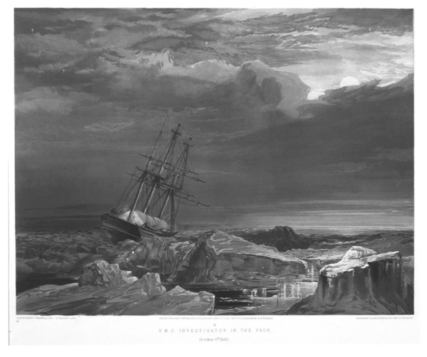
Figure 5.6 Samuel Gurney Cresswell, H.M.S. Investigator in the Pack. October 8th 1850, 1854. Lithograph, 44.3 × 61.2 cm.

monochrome sketch, probably indicative of the only materials then available to Cresswell, two or three comparatively large figures walk on the ice, which appears more stable than in the lithograph. In the latter, the glow of light coming from the ship points to a spark of humanity that poignantly highlights the inhuman aspects of the ice pack.