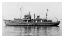
巡視船(艇)PS 哨特:哨戒特務艇 230トン