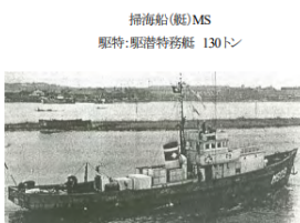
掃海船(艇)MS 駆特:駆潜特務艇 130トン

Not long after Joy ordered the MSA's mobilization, MSA captains and crews in the Inland Sea region received orders to immediately prepare for duty. These orders took MSA officers and sailors alike by complete surprise. Before October 4, there had been no indication that a mission of any significance, let alone a deployment to Korean waters, was imminent. Unaware of the reason for their mobilization, MSA vessels hastily departed for the arranged rendezvous. By October 5, all twenty MSA vessels had reached their assembly point and anchored off the town of Karato near the port of Shimonoseki (Joy's orders called for MSA vessels to meet at Moji, but Japanese firsthand accounts indicate that the vessels ultimately gathered at Karato in Yamaguchi prefecture instead). 35