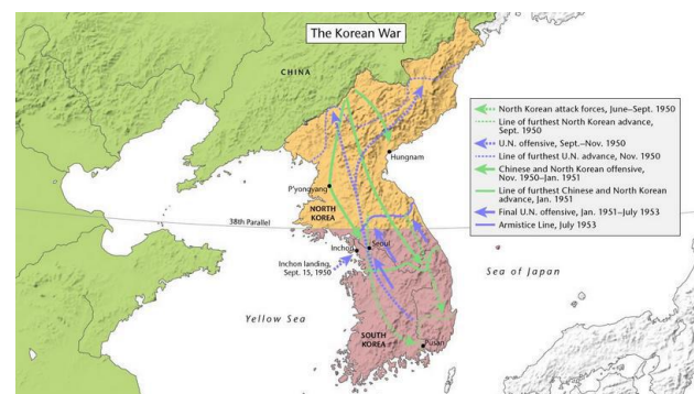
Figure 1: Map showing major advances by both UN and Communist forces during the Korean War. Map of South Korea.

undermined by poor training and the lack of effective antitank weaponry. By July 1950, North Korean forces surrounded South Korean forces along with a growing number of American and United Nations' units in a "pocket" bordered by the Nakdong river to the north and the port city of Busan to its south. At the brink of defeat, South Korean and American forces successfully mounted a defense that staved off collapse. Exploiting the North Korean military's exhaustion, South Korean and UN forces went on the offensive. On September 15, 1950, US Marines landed at the port of Incheon, and rapidly advanced on Seoul. Alongside US and South Korean personnel, Japanese merchant marine sailors also participated in the Incheon operations in the capacity of ferrying and landing US Marines on Incheon's beaches. In some cases, Japanese sailors witnessed combat between US and North Korean forces. 14 However, no Japanese personnel participated in sweeping Incheon Bay of mines in September 1950. Concurrent with the Incheon landings, South Korean and UN forces broke out from the Busan pocket and rapidly advanced up the Korean peninsula. By the beginning of autumn 1950 North Korean forces were in full flight - once more crossing the 38th parallel, but now in reverse.